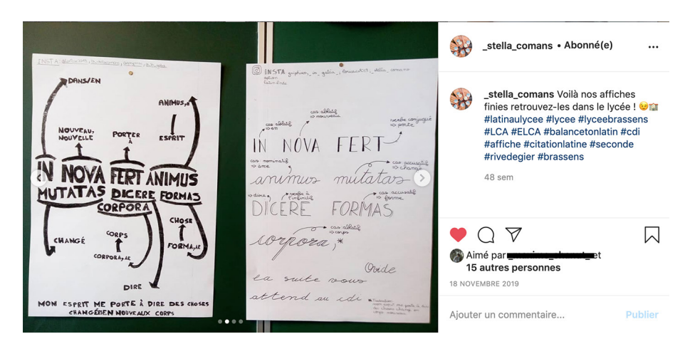
Instagram @ stella comans

Before disseminating this quote in the school, the students create a poster that presents the quote and provides a translation (Figure 8).