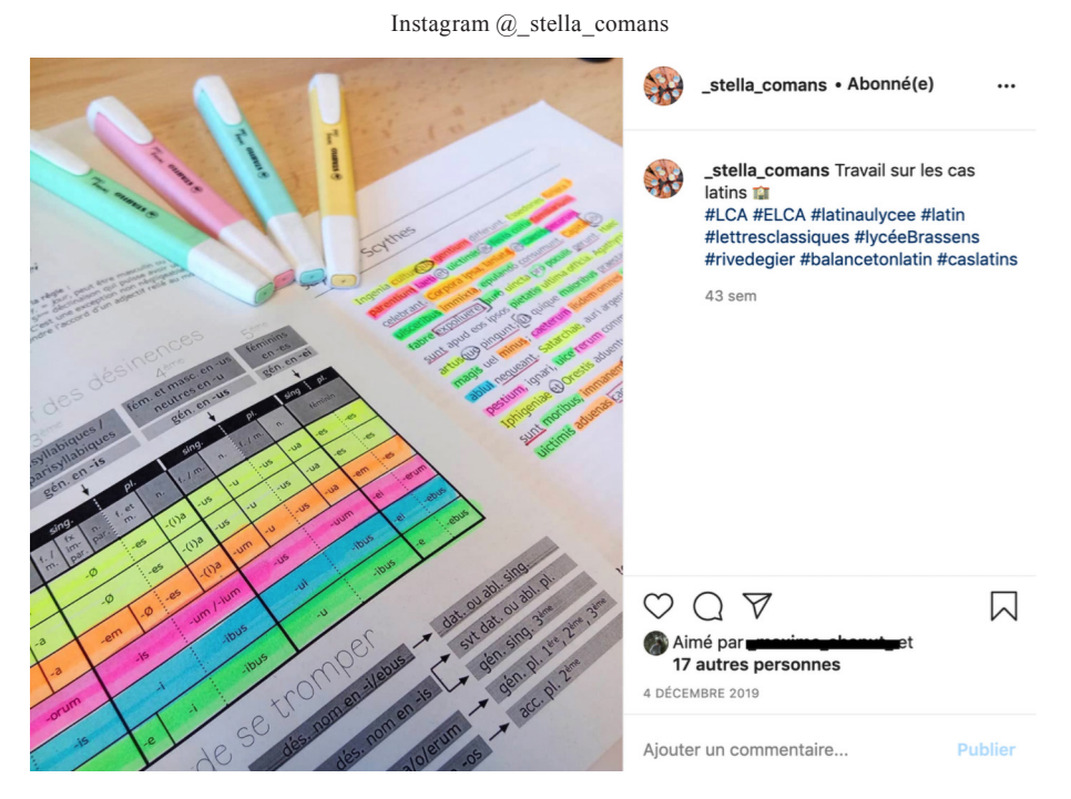
Figure 3. Screenshot of a former Latinist group (2019 project), showing the use of colours and grammar handbook (left of image): "Work on Latin cases"

Moreover, the first part of the year is an opportunity to instruct students on a method that they will be able to apply systematically. They begin by circling conjunctions in black, underlining conjugated verbs in red, framing infinite verbs in red and underlining adverbs in black. After these initial observations, the task is to identify cases of nouns and adjectives. To facilitate the transition from text analysis to translation and to have a unified method in the group, they are advised to use a colour scheme. Therefore, they must identify nominatives and vocatives in yellow, accusatives in orange, genitives in pink, datives in blue and ablatives in green (Figure 3). With this method, the students can translate word group by word group, with the colour scheme that highlights the different functions of the sentence.