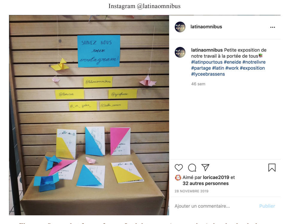
Figure 9. Screenshot from a former Latinist group (2019 project) showing books in an exhibition in the school library: "Small exhibition of our work accessible to all"

Finally, once the various elements, posters and books have been assembled, the students exhibit their documents in the school library (Figure 9). Once the objects of mediation with the staff and other high school students are ready, they can take the chalk bombs and tag the school (Figure 10).