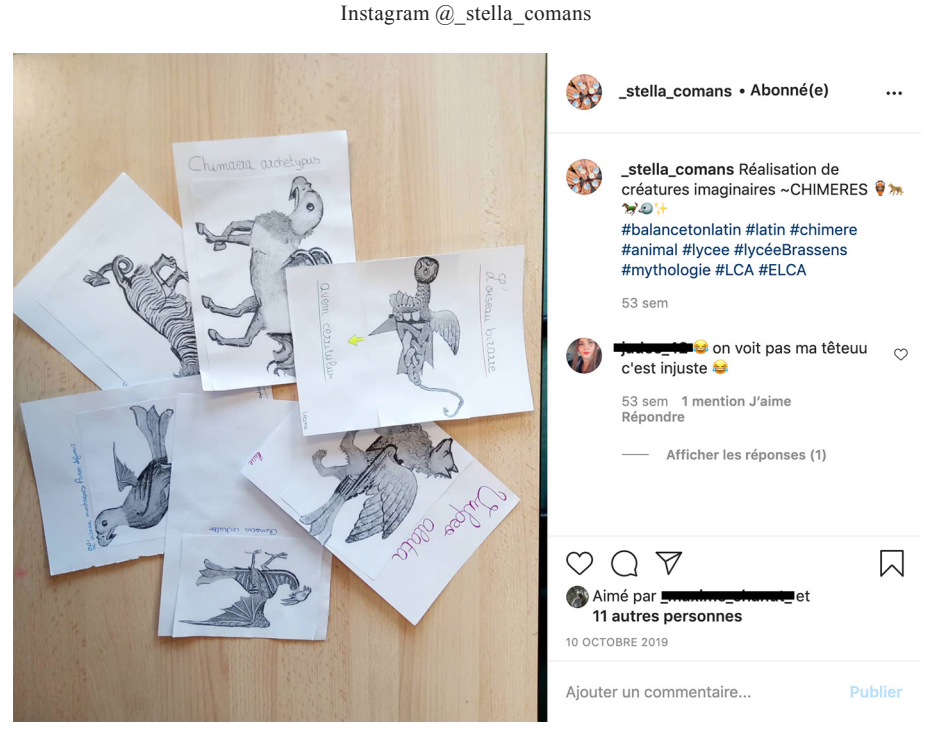
Figure 6. Screenshot of a former Latinist group (2019 project) showing different hybrid creatures created by the students: "realization of imaginary creatures - chimeras"

Latin name. For this purpose, they have to draw from their lesson. Thus, during the 2019-2020 school year, the students called their creatures "vulpea alata (sic)", "chimaera archetypus (sic)", and "avem cerritulus (sic)" (Figure 6). Thereafter, the students pool their production of chimeras and collectively correct the names that were bestowed, according to Linnaeus' nomenclature.