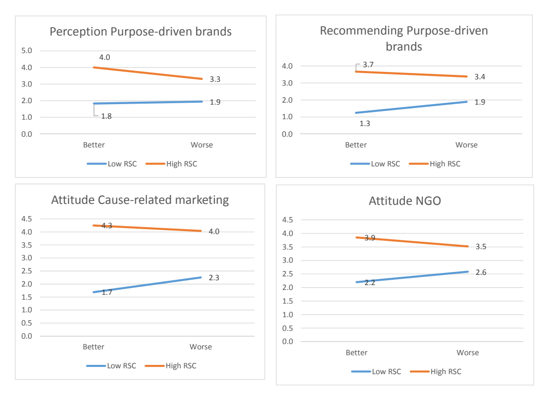
Figure 4. Responsible and sustainable consumption, and personal situation: Perception, recommendation, and attitude