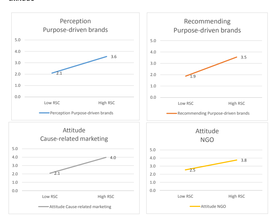
Figure 3. Responsible and sustainable consumer: Perception, recommendation, and attitude

It was found that individuals with a high level of awareness of responsible and sustainable consumption ("high RSC awareness") tend to recognize more purpose-driven brands, B corporations, and cause-related marketing campaigns (47%, 60%, and 71%, respectively) than consumers with a low level of awareness of responsible and sustainable consumption ("low RSC awareness"), resulting in significant differences in statistical terms (F (1.89) = 10.31, p <0.005; F (1.89) = 16.03, p <0.005; F (1.89) = 10.62, p <0.005) (see Figure 2).