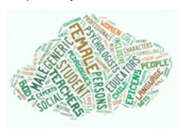
Figure 1 Comparison of word clouds

The analyses initially revealed different teaching profiles in the study sample, characterised by how the professors face the use of an inclusive language as a determinant of a coeducational model, as shown in the following word clouds (Figure 1)