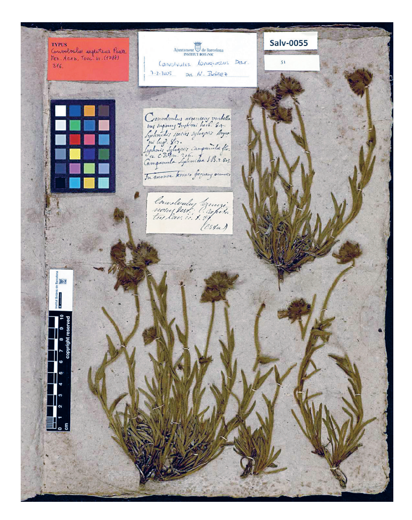
Figure 3. Sheet of the Salvador Herbarium with an specimen of Convolvulus lanuginosus Desr. from Montserrat.