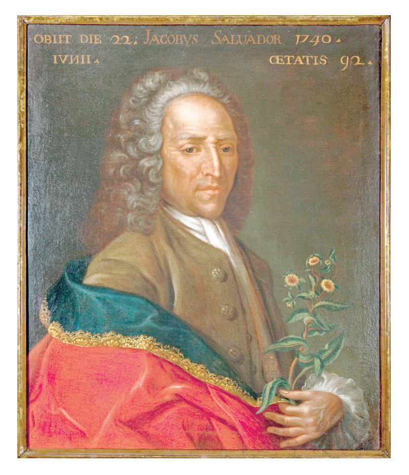
Figure 1. Portrait of Jaume Salvador preserved at the Instituto Botánico de Barcelona

French fleet (1691) and three sieges, with the ensuing bombardments and occupation by the enemy (1697, 1705 and 1714).