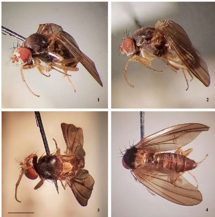
Figs. 1–4. Diathoneura longipennis (Malloch, 1926), male non-type specimen from Peru, habitus, four views: 1, oblique dorsal, 2, left lateral, 3, head and thorax, dorsal, 4, thorax and abdomen, dorsal. Scale bar = 1 mm.

Diathoneura longipennis (Malloch 1926); Vilela and Bächli, 1990: 27, 28, 178, 311 (redescription,