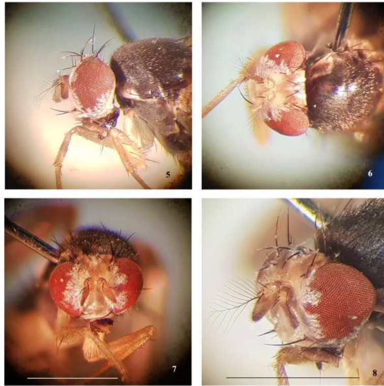
Figs. 5–8. Diathoneura longipennis (Malloch, 1926), male non-type specimen from Peru, habitus, four close-ups: 5, left eye and thorax anterior 1/3, lateral view, 6, head, dorsal, 7, head, frontal, 8, head, oblique dorsal. Figs. 5-7 are at the same scale. Scale bars = 1 mm.