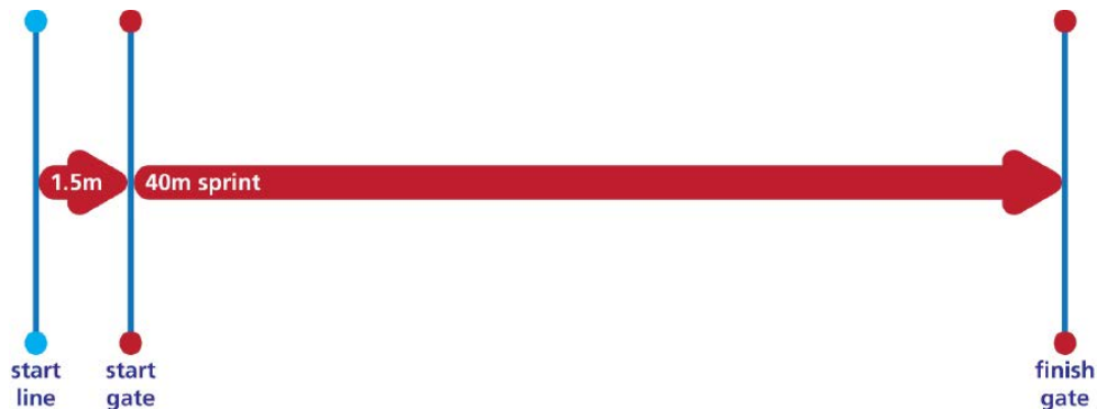
Figure 1: Showing the start point of 40m* 6 test.

the research, its problem and appropriate scientific approach were determined.