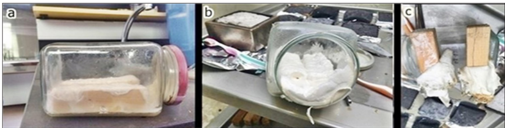
Figure 1: (a) Heterogeneous and (b) homogeneous colonization of wood samples by P. vitreus fungus in glass jars, and (c) the removal of the surface mycelium after infection with the fungus.

Before and after bioincising processes, the kiln-dried weights of the samples were measured and the percentage weight loss of each sample after bioincising was then calculated according to the following Equation 1: