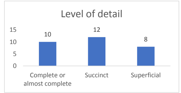
Fig. 2. Distribution of researches by level of detail.

Fig. shows that 33% of the selected papers are complete or almost complete responding to all the quality criteria established in ¡Error! No se encuentra el origen de la referencia. (Yamid Fabián Hernández-Julio et al., 2019). In this case, the first ten authors mentioned in ¡Error! No se encuentra el origen de la referencia. (1-10) (Yamid Fabián Hernández-Julio et al., 2019) represent this category. 40% of the selected studies denote the succinct category. This category is represented by the next twelve authors mentioned in the table (11-22) (Yamid Fabián Hernández-Julio et al., 2019). The superficial category represents 27 % of the studies. They are characterized by the works of the last eight authors mentioned in the table (23-30) (Yamid Fabián Hernández-Julio et al., 2019).