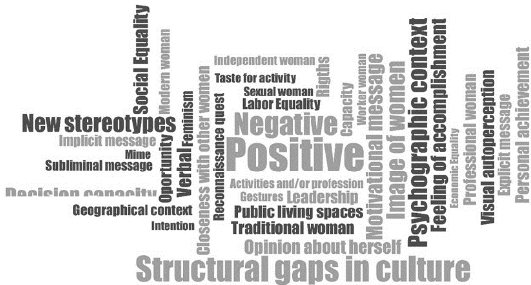
Figure 2. Word cloud with the frequency of codes and categories of analysis.