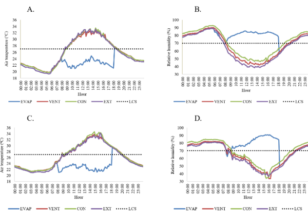
Figure 2. Average hourly variation of temperature and relative humidity in the growth (A and B) and finishing (C and D) phases.

Based on the criterion of [9], the graphical representation of components 1 and 2 (PC1 and PC2), represented in Fig. 3, was plotted. The formation of two distinct groups is observed for growing animals (Figs. 3A and 3B), in which group 1 was marked in blue and group 2 in red. The same formation of the groups can be observed for the finishing animals (Figs. 3C and 3D).