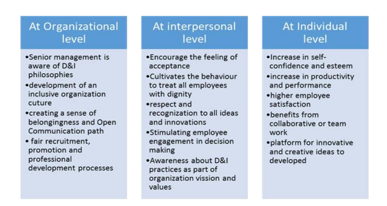
Fig. 2: Outcomes of Properly Integrated Inclusion

The following figure represents the outcomes of integrated inclusion at above mention three different levels of an organization.