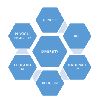
Fig. 1: Common Diversity Categories in a Workplace

Organizations started focusing on having a culturally diverse workforce to compete in highly competitive market. According to ROBERSON, RYAN & RAGINS (2017), there are six reasons for an organization to be culturally diverse to achieve organization competitiveness. The six reasons are: