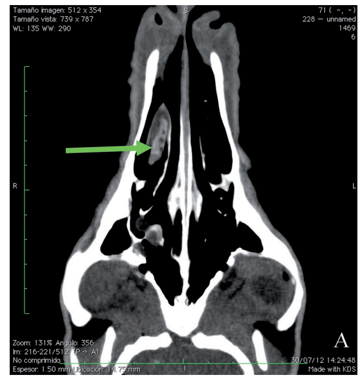
Figure 1. A) Sagittal computed tomography scan of the roe deer head. Arrow points a well-delimitated ovoid structure (a third-instar oestrid larva). B) Axial computed tomography. Arrow points well-delimitated ovoid structures (third-instar oestrid larvae).

In conclusion, despite this is the first reported case in which a Cephenemyia stimulator larva has been found within the host brain, the occurrence and implications of the invasion of the cranial cavity by larvae of Oestridae species underline the need for a reappraisal of our understanding of host-myiasis interactions. For cases involving the invasion of the central nervous system by dipteran larvae, we propose the use of the term "neuromyiasis".