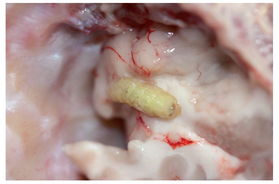
Figure 3. Location of a second-instar Cephenemyia stimulator larva in the host brain of the roe deer after necropsy. The parenchyma of the brain peripheral to the location of the larva appeared embedded in hemorrhagic fluid.