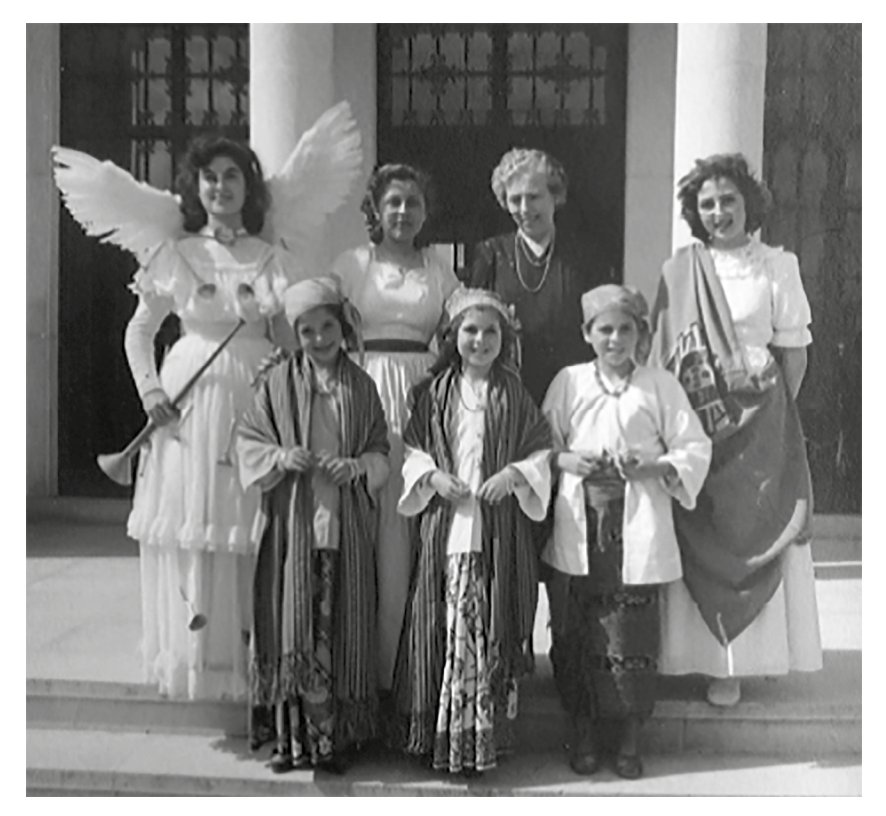
Fig. 2. Virgínia Gersão and some of the protagonists of her play "Anjos de Portugal" (10 May 1952) (Source: Pedro, 2010: 166).

She left for posterity an interesting set of works, namely children's plays, which had a great impact not only in this high school but also in the city of Coimbra itself. Many of these plays were set to music by her distinguished friend Tomás de Borba (1867-1950) and were performed at school parties in Coimbra and in other cities under the direction of Virgínia Gersão herself. These are moments that still last in the memory of the former students due to their magnitude, as they usually involved numerous characters from different age groups who were perfectly well-dressed, with every detail being carefully considered and executed (fig. 2).