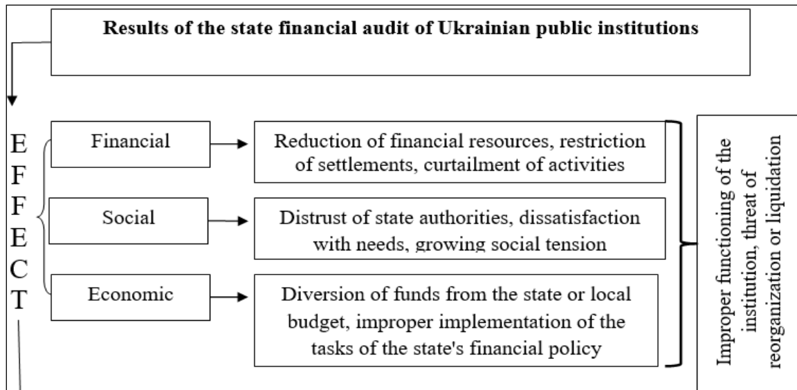
Figure 2: Impact of inefficient organization of internal control system for the activities of public institutions