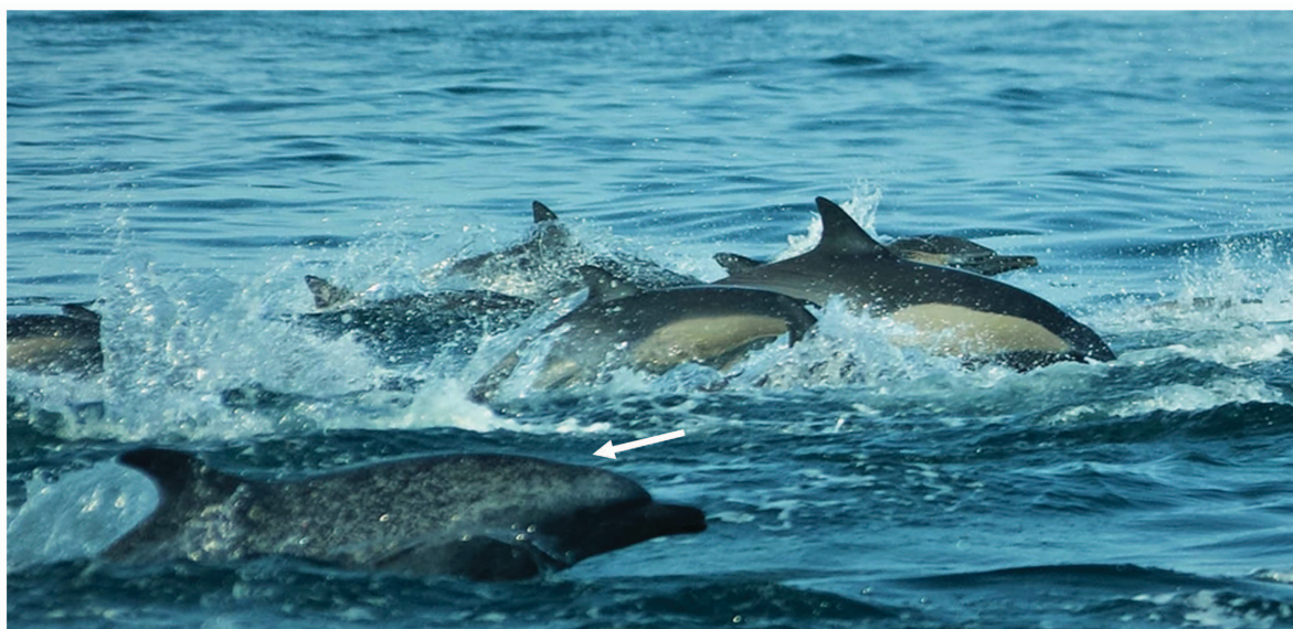
Figure 2. Sighting of the pantropical spotted dolphin (white arrow) swimming within a group of common dolphins / Avistamiento del delfín moteado pantropical (flecha blanca) nadando dentro de un grupo de delfines comunes

The second record occurred on January 7 th 2018, off El Alto (04°15'26"S; 81°15'44"W), a location ( ca. , 17 km south of Los Organos) (Fig. 1). At 2.5 km away, at 0714 h after sighting 4 Bryde's whales ( Balaenoptera brydei ), a group of common dolphins was observed a short distance away. The size of the pod was estimated ( ca. , 1000 individuals). The common dolphins were feeding. Within this group an adult pantropical spotted dolphin showing the same behaviour was sighted. The group were observed for 8 minutes before the boat left. The third encounter occurred on September 21 st 2019. At the beginning of the encounter the boat headed towards a humpback whale mother-calf pair and escort. In the middle of the encounter at 0816 h a large ( ca. , 1500 individuals) travelling common dolphin group was sighted, further north of Los Organos. When approaching the group was approached, and as on the previous two occasions, an adult pantropical spotted dolphin was observed within the group. Unfortunately, no photos of the pantropical spotted dolphin were taken during these two other sightings.