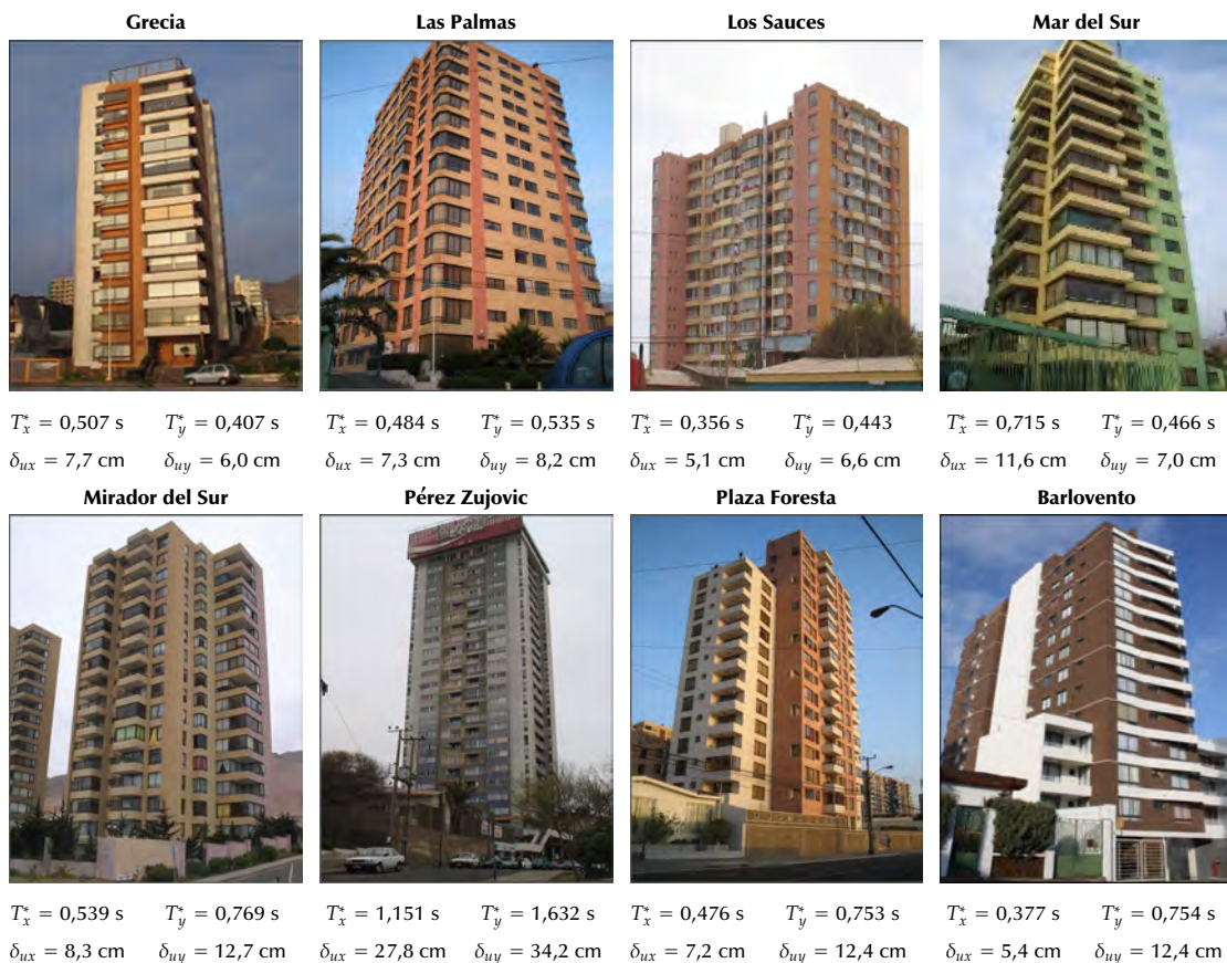
Figure 1. Photos of the buildings, fundamental period, and design lateral displacement at the roof in each direction. Source: Authors

Source: Lagos et al. (2012); Guendelman et al. (2017).