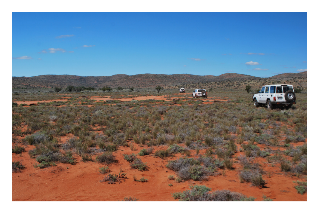
Figure 2. Fieldwork on Ngadjuri lands, Plumbago Station. Photo: Claire Smith, April 2011.

tions on them and could not be readily accessible to the public for these reasons, or because they are so remote.