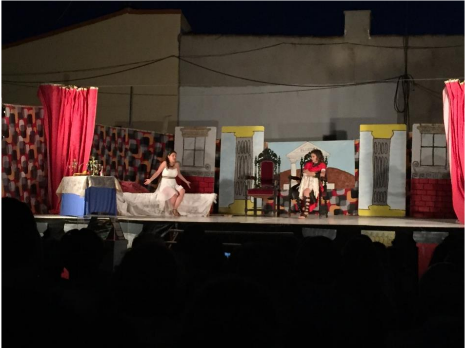
Figure 4. Picture of the local theatre