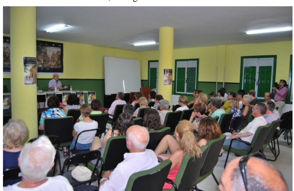
Figure 3. Picture of the Function Room in the Village Hall of Villar de Domingo García, during one of the lectures.

Of central interest were undoubtedly the lectures on the research carried out in the Roman villa of Noheda, which provided real-time information on the progress being made in the archaeological works. But the goal of raising societal awareness of archaeology and the Roman world would not be fulfilled if Noheda was the only subject addressed. As such, a substantial effort was made to engage in conversations with various researchers, who generously agreed to give presentations about their investigations.