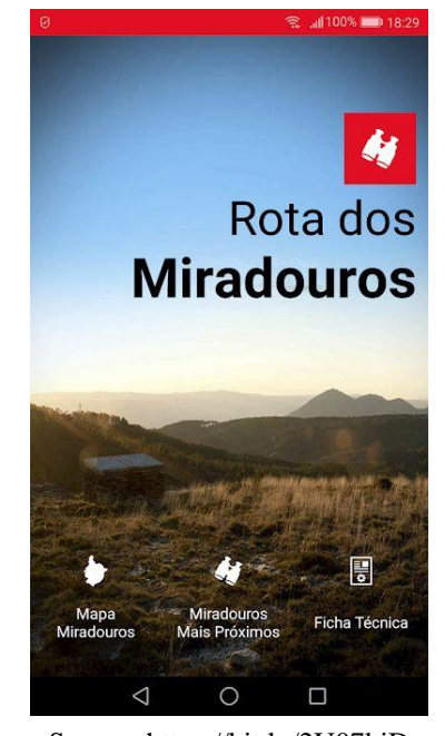
Figure 3. Mondim de Basto Viewpoints Route

It is also intended to create an application for the Viewpoints Route of Tomar with all the useful information for the visitor, with the possibility of working offline, in order to avoid Internet access costs. The only application found in this area concerns the Viewpoints Route of Mondim de Basto (Figure 3).