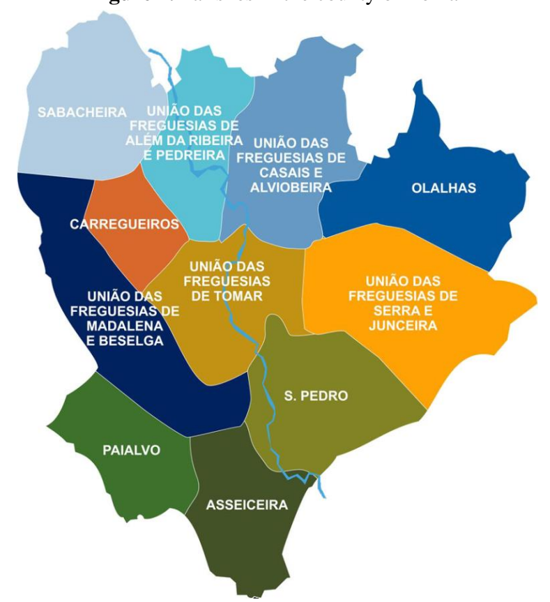
Figure 1. Parishes in the county of Tomar

Madalena and Beselga, Olalhas, Paialvo, Sabacheira, São Pedro de Tomar, Serra and Junceira and Tomar (São João Batista and Santa Maria dos Olivais).