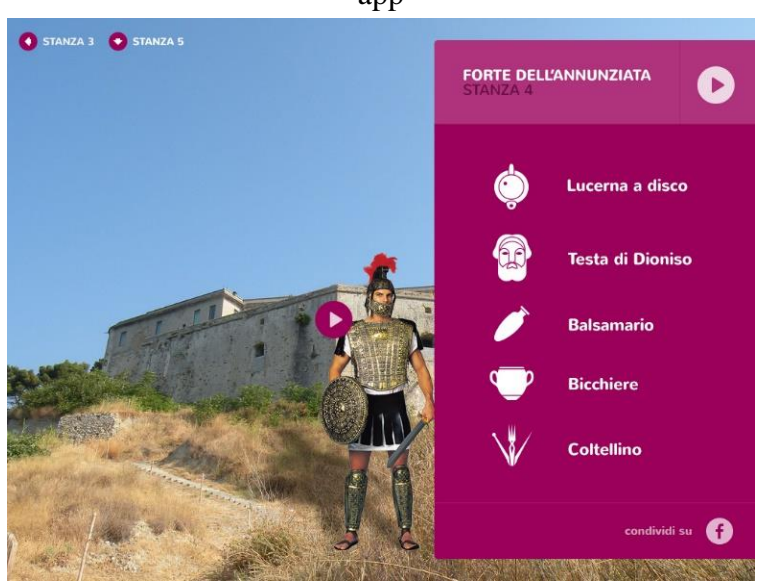
Figure 8. Gamification applied to heritage: Liguria Heritage augmented reality mobile app

Gamification quickly became a strategy in numerous organizations in almost every sector. Heritage is no exception, with several examples in this area (Xu, Weber & Buhalis, 2013) (Figure 8), including in the city of Tomar (Almeida, Marques, Almeida & Lopes, 2018).