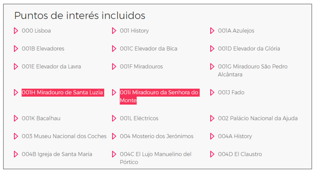
Figure 5. Audio-Guides in Lisbon provided by Civitalis