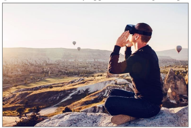
Figure 6. Virtual reality applied to heritage: Hop180

Through virtual reality, visitors emerge in a virtual world, experiencing a variety of sensory stimuli that make the experience unique. One of the possibilities is its use to enjoy experiences in spaces near the viewpoint whose access is limited by nature or whose state of conservation no longer allows its visit (Figure 6).