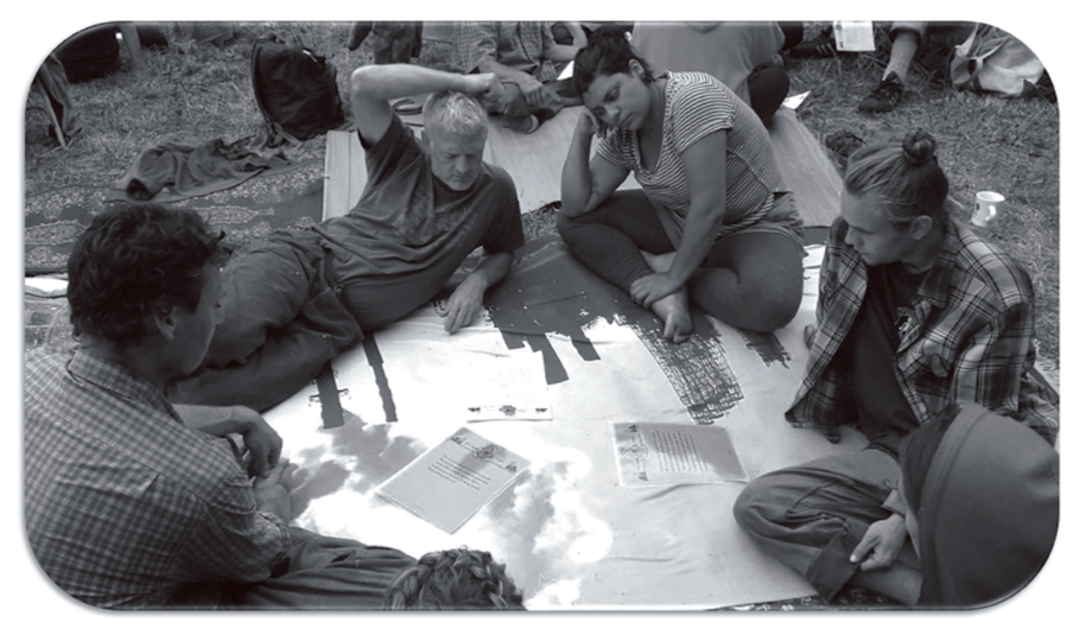
Figure 26. We are petroleum people performance documentation. 2017.

After twenty minutes they have read all the emulations several times and begin a discussion. Sometimes they lapse into a somber brooding silence. Then they discuss. Finally, in one big group, the original Gwich'in statements are read alternating with their respective petroleum emulations. After reading through once or twice, the group has a big discussion. This presencing of petroleum embodiment works through rhetoric of substitution and comparison of caribou sustenance for petroleum sustenance. It also performs a figurative translation that changes (expands) how participants conceptualize and articulate their existential connections to petroleum.