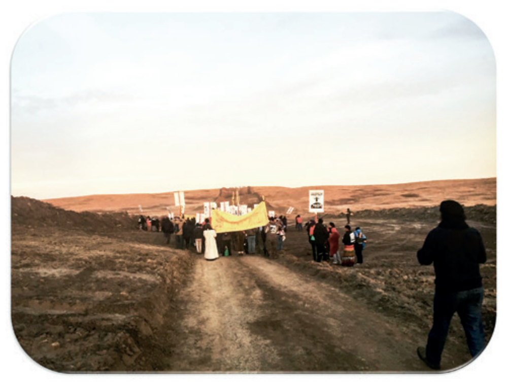
Figure 28. Water protectors. 2016.

In 2016–17 within Standing Rock Sioux territories, thousands of petroleum embodiments (human people) attempted to prevent another pipeline of petroleum capacitation. Following the injunction of youths and finding motivation in prophecy (indigenous jurisprudence), petroleum bodies fought against what is good for them, against their own petroleum embodiment. Their actions are a performative reach into an absence figured and made conscious by petroleum presencing. Their intense and fervent struggle was a manifestation of the power of a virtual non-petroleum human alongside. The strong material struggle of negative capacitated embodiments speaks.