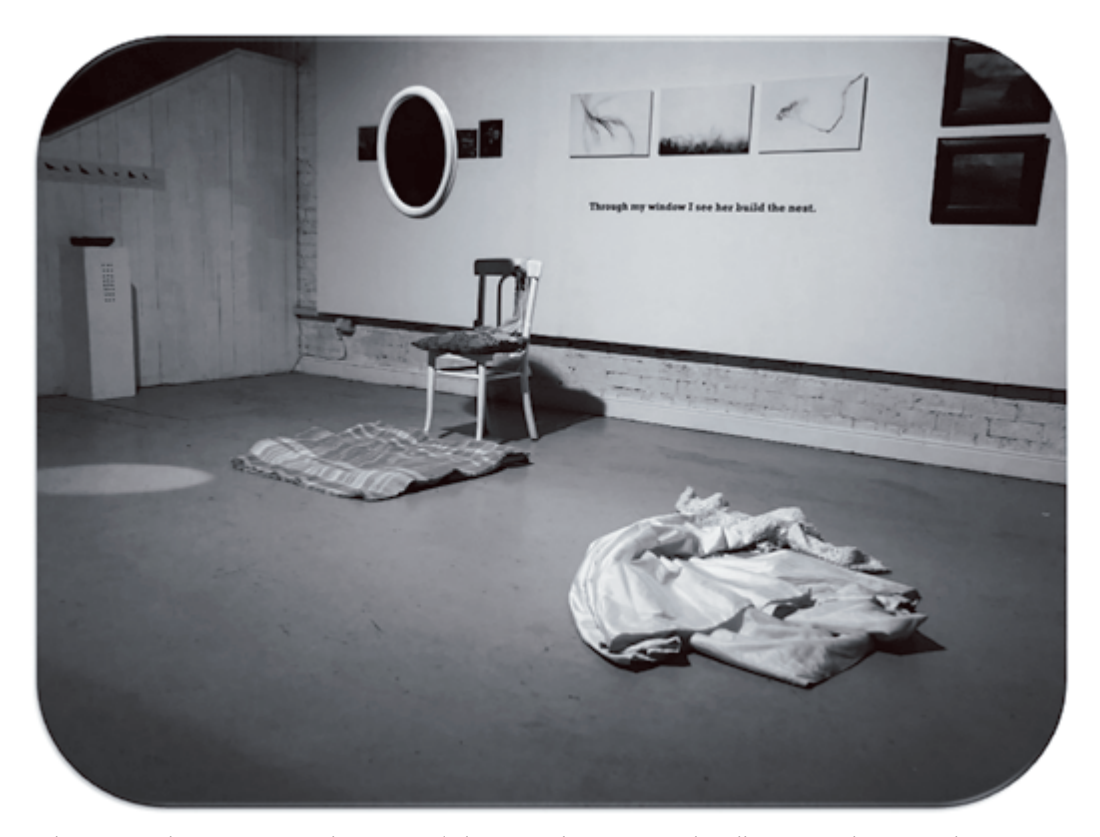
Figure 14. Choreographic Constructed Space in 'Silent Pact', PS Squared Gallery, March 2018. Photo: Una Lee. 2018.

In Silent Pact, I imagined the dance would take place in a bedroom, moments before the bride dresses for her wedding. In the room, there was a wardrobe and two women: myself as the dancer embodying the re-lived memory of my mother, and voice artist Una Lee as her silenced voice. The image evolved from a poetic relation among the bodies and the space where Una's voice is heard, but her body concealed, and the dancing body is seen, but her voice is not heard. Starting from this imagery, the central theme I wanted to explore was the story of a woman torn between her maternal feelings, and the religious and conservative values of her time, in the 1980s in Argentina. It was later that the idea of a mirror hanging from the ceiling in the middle of the room (as seen in the image below) emerged as a more compelling, and practical way for conveying the silenced voice. Interestingly, during the performance, I discovered that, at times, the audience would see themselves in the reflection of the mirror, possibly becoming aware of themselves at watching the dance.