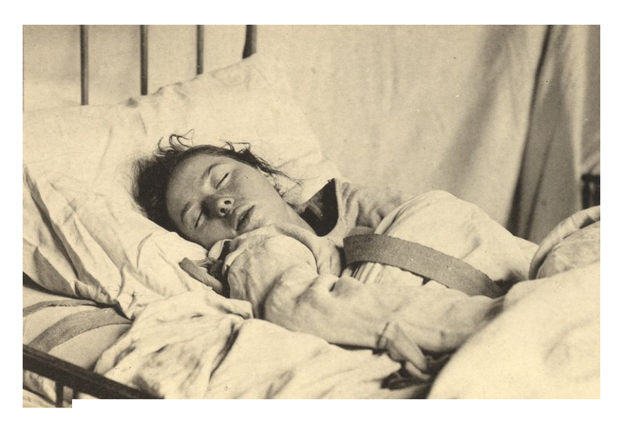
Image 1. A female patient with hysteria- induced narcolepsy at the Pitié- Salpêtrière Hospital in Paris, France

a clearer differential diagnosis of narcolepsy-cataplexy, the frequency of misdiagnosed cases — psychiatric diseases (31%), depression (20%), insomnia (20%), and obstructive sleep apnea (13%) — makes narcoleptic patients, articularly adolescent women, reluctant to go to consultation.