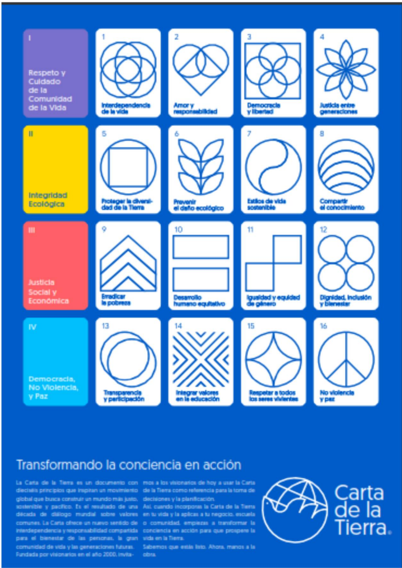
Figure 5. Poster of the Earth Echarter. The sixteen actions that the letter proclaims are graphically summarized.UNESCO and the IUCN (World Conservation Union). www.earthcharter.org. www.cartadelatierra.org

However, we are also afraid that unfortunately, in a few weeks, when the fear of the coronavirus stops us from "clenching our throats" and the desire to continually talk about the pandemic and the lies and truths of this reality is extinguished, everything will return to silence. We are afraid that everything will return to the sad reality of selfishness, to which we cling upon also hope that soon enough, the clouds will open on the horizon, and those who keep the illusion and the desire to fight for a better world will be illuminated by the Earth's Charter. Remembering the words of Miguel de Cervantes (free translation): "Know that all these storms