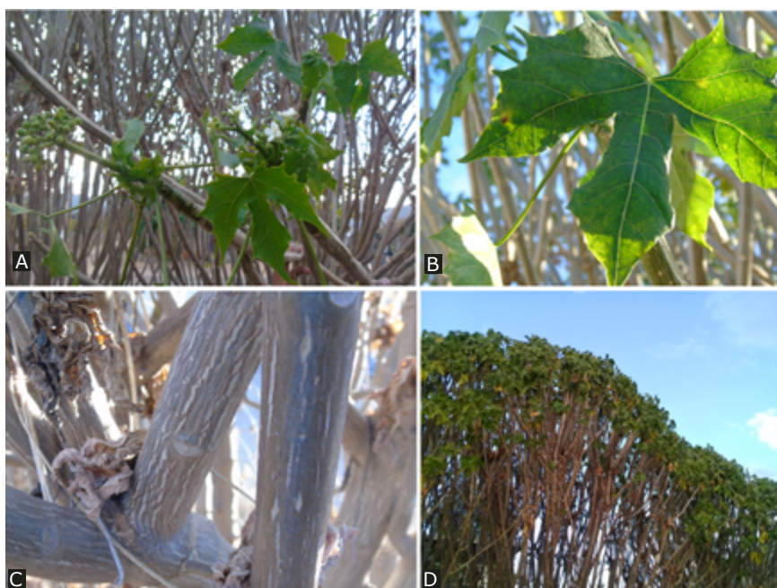
Figure 2. Photographs of Cnidoscolus aconitifolius . A) flower buds and plant flowers; B) lamina, primary and secondary veins, and petiole; C) stem; D) canopy.

de Porfirio Díaz, state of Oaxaca, Mexico), which is located in the following coordinates: latitude: 16.2705 and longitude: -96.5874 16° 16' 14" North, 96° 35' 15" West.