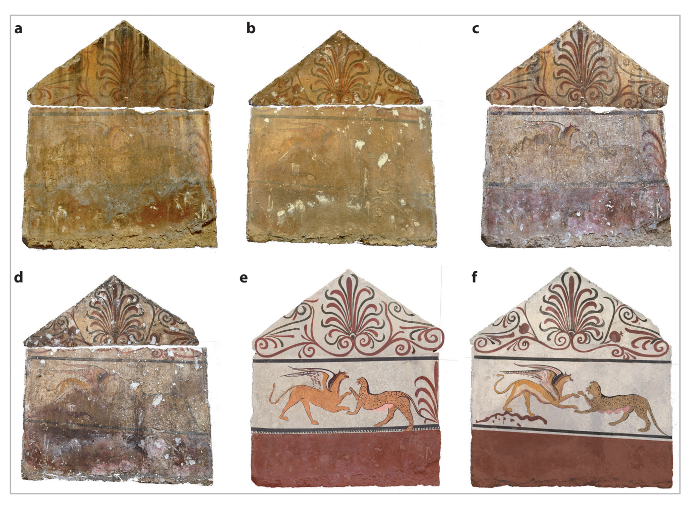
Figure 6. - Tomb 418. Slabs of travertine plastered and freshly painted. Paestum Archaeological Museum, Barlotti property, Spina Gaudo area. East and West Short Side Slabs: the fight between the mythical animals' Gryphon and Panthera, decorated with plant elements, palmettes and pomegranate fruits. (a)(b) Photo before restoration; (c)(d) Photo after restoration; (e)(f) Virtual iconographic restoration proposal. ©Annamaria Amura, 2019).