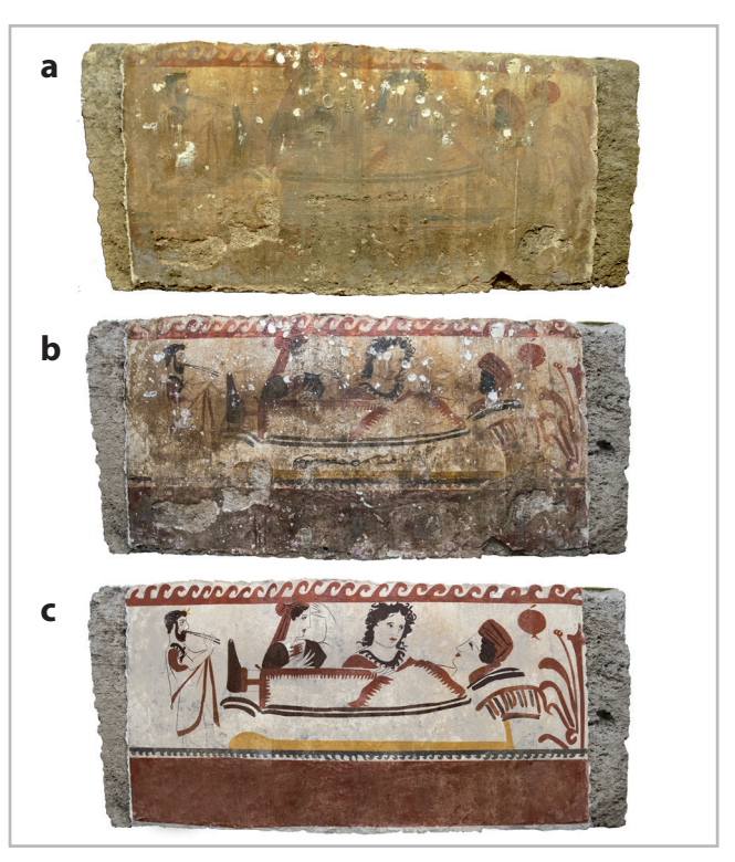
Figure 4. - Tomb 418. Slabs of travertine plastered and freshly painted. Paestum Archaeological Museum, Barlotti property, Spina Gaudo area. North side slab scene: the exposure of the body of the deceased and the mourning of women. 125 x 53 cm. (a) Photo before restoration; (b) Photo after restoration; (c) Virtual iconographic restoration proposal. ©Annamaria Amura, 2019).