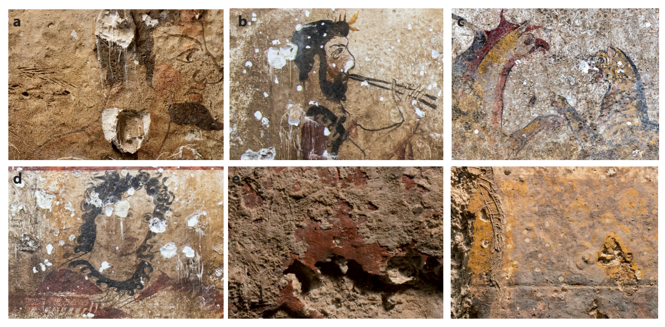
Figure 1. - Details of the Tomb 418. (a) South Slab. Face of a warrior; (b) North Slab. Face of a musician; (c) East Slab. Fight between Gryphon and Panthera; (d) Detail of North Slab scene; (e) Traces of original red ocher; (f) Traces of original yellow ocher.

The tomb restoration and the virtual reconstruction were carried in 2016, with the contribution of the Italian American Forum.