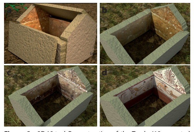
Figure 3. - 3D Virtual Reconstruction of the Tomb 418, executed by Salvatore de Stefano (s.d.s. grafica, Napoli). (a)(b) Typology of tombs with a double sloping roof. Image before restoration; (c) Tomb 418. Image after restoration; (d) Tomb 418. Image of the virtual iconographic restoration proposal

In Tomb 418, the range of pigments is restricted. The white elements use the color of the plaster, circumscribing it in black or red. The pigments are: carbon black, smoke black, bone black, red ochre, white lime and yellow ochre. The lines of the drawing in black were selected with the "slicing segmentation" algorithm in Photoshop® CC2019, to allow an increase in contrast of the image in order to restore its original color (Adobe® Photoshop® CC Help 2018, Gonzalez and Woods 2012). In the virtual reconstructions [figure 4c, figure 5c and figures 6e-f] it's possible to appreciate the rapid style of painting, which defines the fields and the lines that built the scenes through few uniform colors. The images of the iconographic restoration thus created, were projected on the mesh surface of a three-dimensional model made with AutodeskTM plus 3DS MAX© software [figure 3].