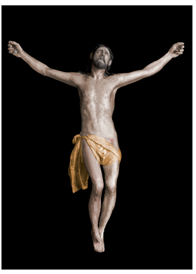
Figure 4.- Virtual restoration of the Crucifix of Monte Giove.

signs of passing time (Maino 2017; Bennardi and Furferi 2007) [Figure 5].