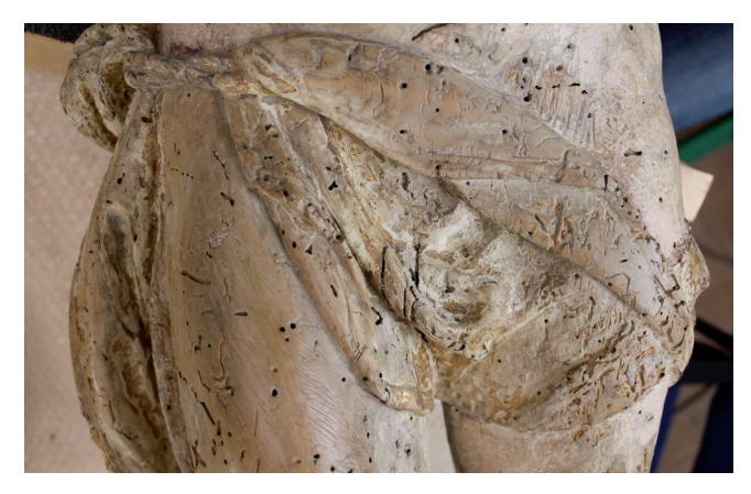
Figure 2.- Holes made by the woodworm insects.

for the Art Historian or the Restorer but for it most direct viewer – the religious communities – it's sometime difficult to understand a key concept: time passes and inevitably modifies the artwork. The devotional feature poses as a challenge for the Restorer, as an intermediary between what the artwork is and what it represents for its religious viewer. The Restorer has to define the limit before "committing an artistic or historic forgery" (Brandi 2010).