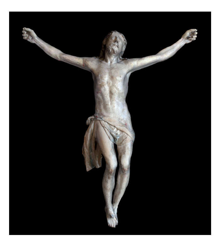
Figure 1.- Crucifix of Monte Giove after the cleaning.

For Sacred Art, acceptance of the current status and his visual integrity has a different meaning and it's necessary to take into account that the artefact appearance can some time take precedence over any other aspect. Neither