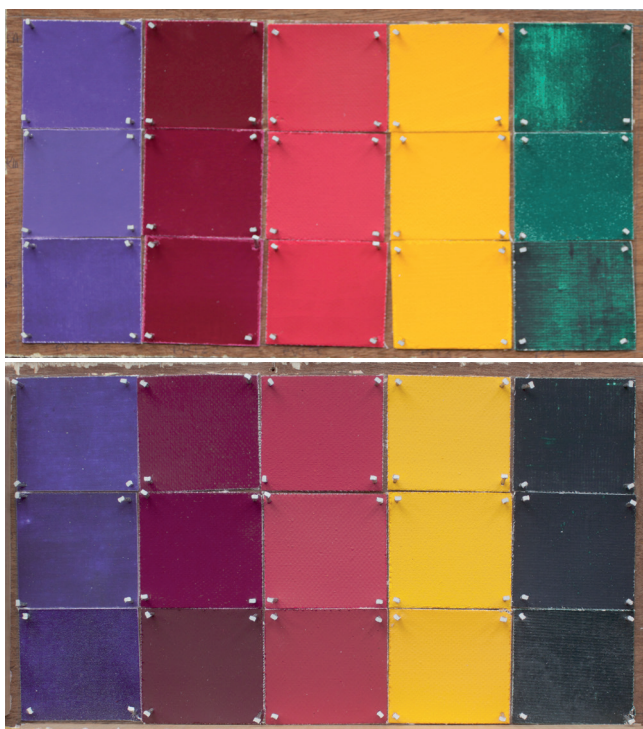
Figure 3.- Mixing some of the materials with various pigments. From top to bottom: Regalrez 1094 (10% in Shellsol D40), Klucel G (1% in water), Arabic Gum (10% in water), Aquazol 200 (10% in water), Aquazol 500 (10% in water), QOR medium solution mixed with pigments. We can clearly see the difference of light and saturation between the retouching materials, especially in darker colors. .