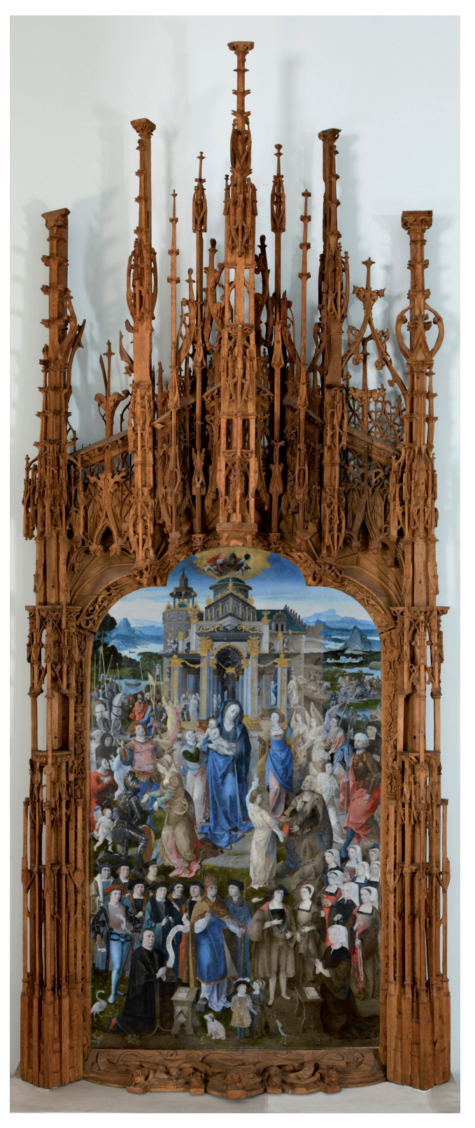
Figure 8. - Mock-up of the painting after treatment inside its original frame

This technique has also some limitations. Firstly, it is necessary to carry out highly finished illusionistic retouching of the original painted fragments which have suffered from wear, when they are located next to grisaille areas. In order for the original painted fragments to coexist next to the grisaille retouched areas, a similar visual conservation condition of the two elements is necessary. The areas retouched with the grisaille technique are necessarily in good condition, so the fragments of original paint next to them need to appear in good condition too, in order not to introduce an imbalance. Secondly, a better result is obtained if the original area around the loss is a multi-coloured, the grisaille reconstitution will then be easily discernible. Thirdly, when the neighbouring original colours are the same as the grisaille tone, one must retouch the loss to a lower tone than the one in the painting, otherwise it creates confusion.