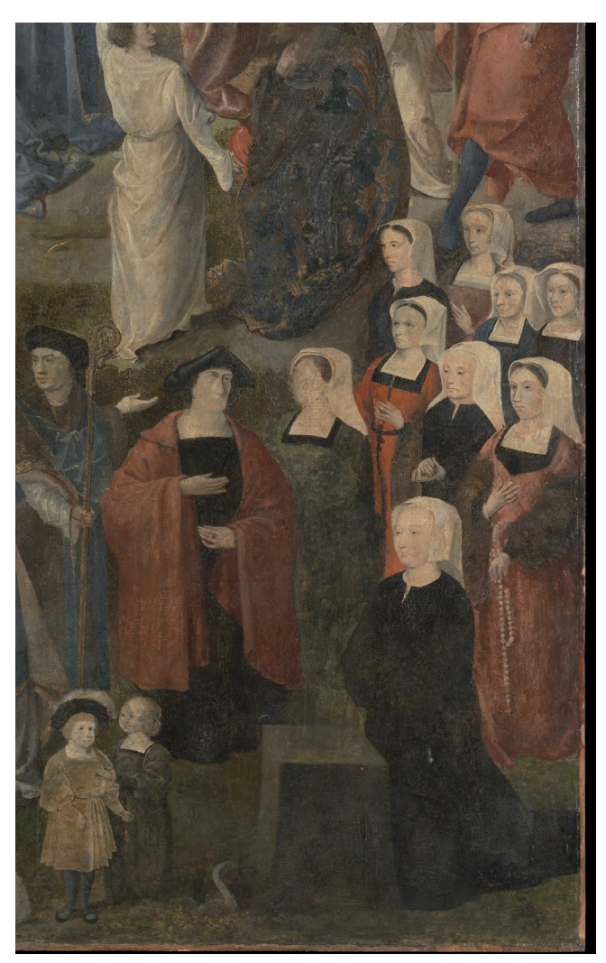
Figure 3. - Details of the retouching dating from 1952 at the bottom right-hand corner on the Puy 1521. Picture before cleaning taken in 2017. 248

Nowadays, the most used visible retouching techniques are pointillism and tratteggio . They were both considered but both rejected as they were judged aesthetically unsuitable for such detailed paintings. Indeed, the dots or fine lines which are the basis of these techniques would