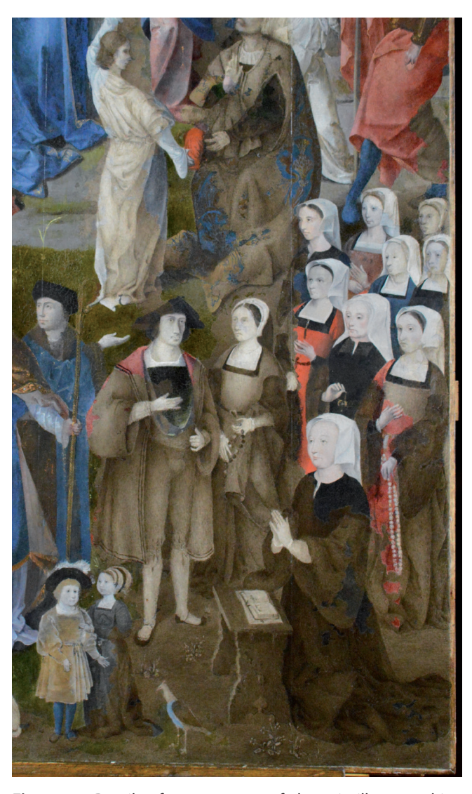
Figure 7.- Details after treatment of the grisaille retouching method at the bottom right-hand corner of the Puy 1521.