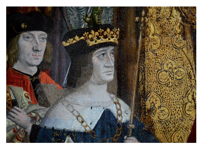
Figure 5. - Reconstruction of the portrait of Louis XII with the grisaille method on a loss of the Puy 1499, based on the painting by Jean Perréal in 1514 kept in Winsor Castle.