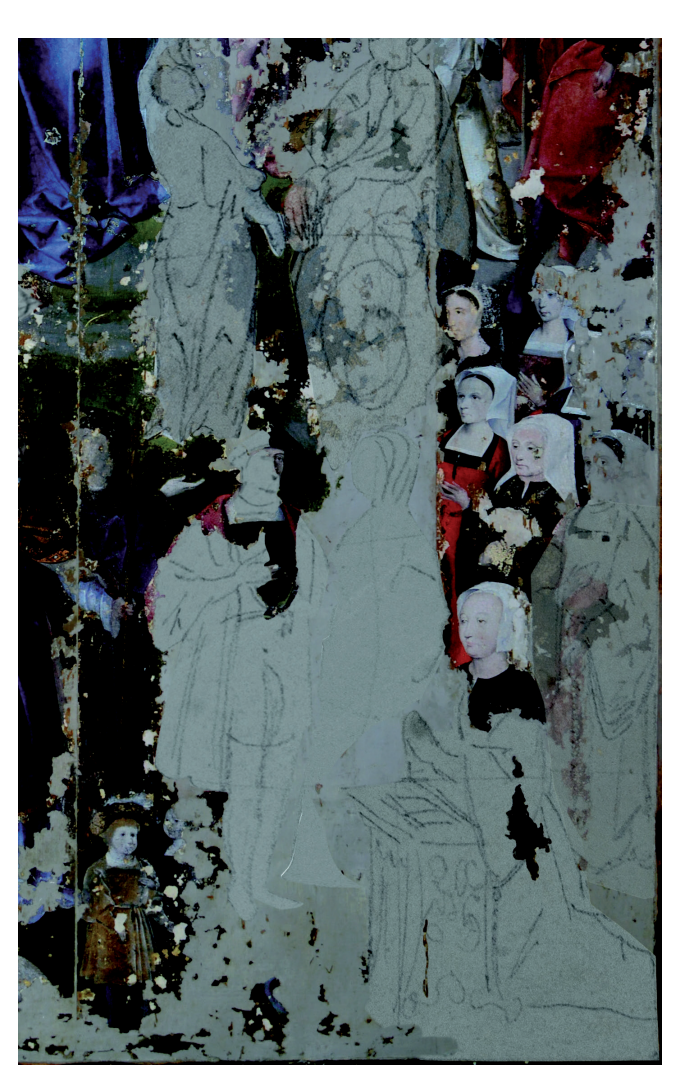
Figure 6. - Digital mock-up where details of the sketch are inserted inside the losses at the bottom right-hand corner of the Puy 1521. ©picture Séverine Françoise; ©sketch Picardie Museum; ©mock-up Frédéric Pellas

Reconstruction with the grisaille method was modeled step by step, with a lighter tonal value than the original but we observed that it drew attention to the large losses. The dark tonal values were built up progressively in order to balance with the tonal values of the original composition. On completion, the focus of the viewer is drawn to the coloured areas of original painting, not to the grisaille method reconstruction of the large losses [Figure 7]. Gamblin Colors®, pigments ground in Laropal