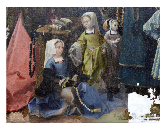
Figure 4. - Retouching tests attempted on a large loss of the Puy 1518: at the left, reconstruction with the grisaille method; at the right, reconstitution in lighter tone.

with lighter toned colours would have drawn attention by unbalancing the overall composition through lack of contrast provided by the dark tones.