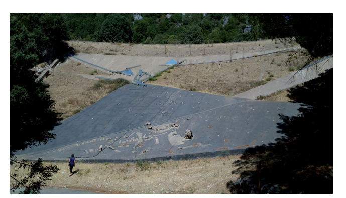
Figure 3. - Maria Lai, La Scarpata , 1993, Ulassai, photo taken in 2017, courtesy © Archivio Maria Lai by SIAE 2019.