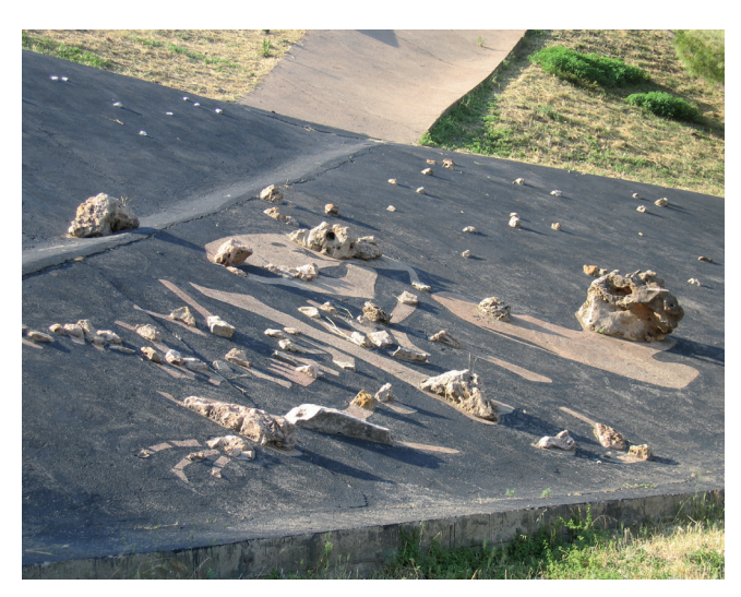
Figure 4. - Maria Lai, La Scarpata , 1993, Ulassai, photo taken indicatively in 2005, courtesy © Archivio Maria Lai by SIAE 2019.

The third and last case study is La strada del rito, located alongside a 7-kilometer-long country road. This work consists of 366 elements in cement on a reinforced concrete wall, which recall the multiplication of the loaves and fishes. In this case, during the realisation phase, Maria Lai had used both raw concrete and coloured cement with ochre and brown paint, often adding to the mixture some pebbles in different shapes and shades of colour. After the carrying out, the artist decided to paint only some parts of the work in white and black, but as it comes up from the interviews of Maria Sofia Pisu and Teodolinda Puddu, she did not like the final result [figure 5-a]. As opposed to the previous work, Maria Lai's intention was that the artwork reflected the colours of the nearby mountains. Discussing the matter with relatives and friends, she also started to appreciate the relation with the plants and the microorganisms that slowly started to colonise the surface of the artwork. Nowadays, the state of conservation is not good: it is possible to notice damaged, broken and missing parts, as well as some areas that are almost completely covered by the vegetation.