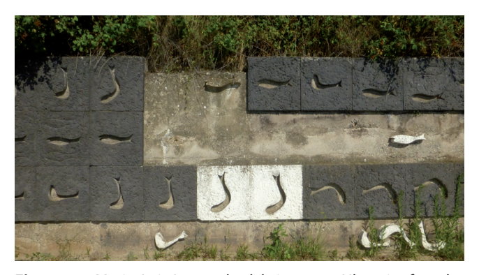
Figure 6. - Maria Lai, La strada del rito ,1992, Ulassai, after the retouching, photo taken in 2018, courtesy © Archivio Maria Lai by SIAE 2019.

130 elements [figure 5-b]. The implemented modifications were carried out by unskilled workers in a sloppy manner, which significantly altered the meaning of the artwork. Looking in detail it is therefore possible to notice broken elements subsequently retouched, drippings, retouching on elements that were not originally coloured as well as a degradation of the acrylic colour used [figure 6]. In this case an intervention aiming towards the elimination of the recently repainted areas shall be advised, also including a reintegration of the damaged elements and a relocation of the detached parts.