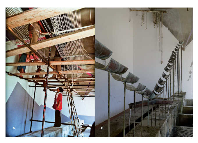
Figure 2. - A- Maria Lai during the realisation of Telaio-soffitto , 1982, Ulassai, inside the wash-house, courtesy © Archivio Maria Lai by SIAE 2019 [E. PONTIGGIA, Nuoro 2017]. B- Maria Lai, Telaio-Soffitto , 1982, photo taken in 2018. It is possible to notice the white wall after the repainting and retouching with dark grey and white paint on the side wall, courtesy © Archivio Maria Lai by SIAE 2019.

the matter. However, at least two more interventions were discovered: retouching with dark grey and white paint on the side wall (only noticeable from comparing the pictures) [Figure 2-b] and at least one intervention of repainting with white paint on the bottom part of the counter façade (which also led to a partial covering of some names in the signatures).