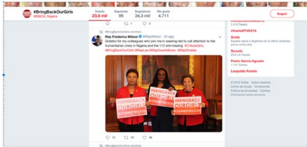
Figure 3 Screenshot of the official account of the 25 th of August 2019