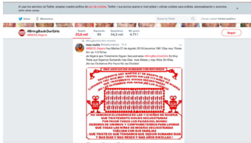
Figure 4 Screenshot of the official account of the 27 th of August 2019

Another element is the conceptualisation of 'girl' and the need to approach this within the intrasectional framework mentioned above. Here, one needs to place these women in their geographic and religious context. There are certain laws that are different in North-Eastern Nigeria. One is that men may indulge in polygamy. Another is that women cannot own land. However, women find other means of financial support in the home (International Crisis Group, 2016). In addition, a report by the International Crisis Group notes that while women's bodies are a battleground in international conflicts, religion, and war, North-Eastern Nigeria has refused to set 18 as the minimum legal age at which women can marry (International Crisis Group, 2016: 3).