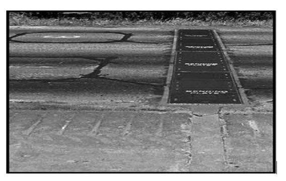
Figure 3. WIM system of flexible bands [35]

• Weigh in Motion - WIM: These systems are designed to determine the weight of vehicles in motion. They can help control the care of roads, since an overweight vehicle is a factor for their premature deterioration. These systems work thanks to the location of load cells, piezoelectric systems or flexible bands. Figure 3 shows a photograph of a flexible band WIM system [35].