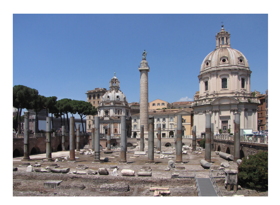
Figure 3. Forum Traiani, Rome: Buildings that come from various epochs but use the same or very similar architectural language. There is not much difference between the "modern" (in 18th century terms) and the "old" (2010)

It is also necessary to emphasize that the changes in both natural and cultural landscapes were not structural: the changed environment did not strikingly differ from what people were used to. Rome, once rebuilt in the Baroque style, still structurally resembled Renaissance, Medieval and Classical Rome because the architectural language of new buildings and urban plans followed the grammatical rules developed and established in previous periods (Fig. 3). Similarly, the cultivated country landscape, with its small, narrow fields, bushes, groves, deer parks and ponds did not look fundamentally different than the uncultivated landscape, a situation occurring in temperate climates but likely also in the tropics (see for example the abovementioned settlements on New Guinea) (Fig. 4-5). This important fact will be further discussed in the second and third parts of our study.