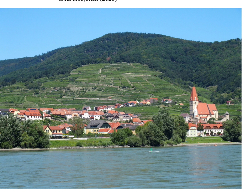
Figure 1. Weißenkirchen in der Wachau, Wachau Danube Valley, Austria: The agricultural landscape, inhabited since the prehistoric times, is still largely used to grow wine. It is both a World Heritage Site and a nature conservation area. An example of agriculture respecting the limits of the local ecosystem (2020)

suffer from weather fluctuations or other disturbances causing food scarcity (Fig. 1). At the same time, awe of religious and political authorities made them respect territories or artefacts declared taboo; some Saharan inhabitants still avoid rocks with prehistorical drawings for fear of disturbing evil spirits, even though these are people of a hard, unsentimental character who formally adhere to Islam and use modern technology (Soukopova 2012).