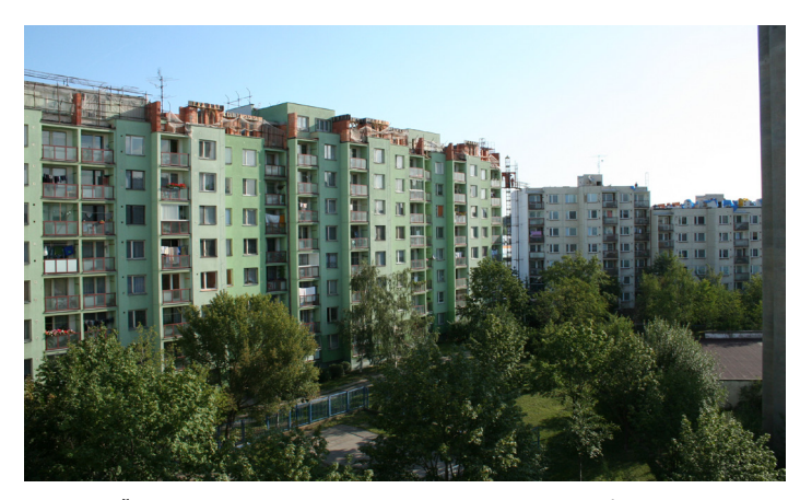
Figure 10. Černý Most housing estate, Prague, second half of the 20<sup>th</sup> century: Although the urban environments in figs. 9 and 10 are closer in terms of their dates of origin and their inhabitants' social structure than the places in figs. 8 and 9, their character does not show the same closeness. Why is this the case? (2007)

The numbers concerning heritage monuments are equally significant. In the 20<sup>th</sup> century, Amsterdam lost one fourth of its historical buildings, Rome one third, Cairo a half, and Beijing most of its traditional developments, a process approved by the majority of these cities' inhabitants (Tung 2001: 16). The two World Wars almost entirely destroyed scores of historical cities in France, Germany, Poland and Russia (Eckardt 1980; Kretschmer 1988). In