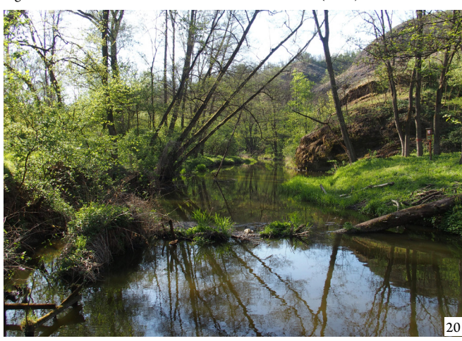
Figure 23. Macau: Architectural monoculture and chaos (2018)

Figure 22. A field in Czechia: Biological monoculture with reduced structural order (2020)