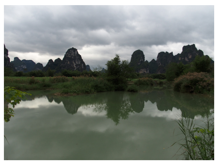
Figure 5. The same is true for the rice or sugar cane fields in the south of China: Landscape around the village of Mingshi, Guangxi Zhuang Autonomous Region (2019)

was a model example. The Bavarian King Ludwig I decided to save it from modernization, aiming not only to protect the architectural style (no buildings in the by then fashionable Neoclassical style were allowed among the Gothic landmarks) but also to preserve and fuel memories of the city's great cultural and political past, connected especially with Albrecht Dürer and his generation (Erichsen and Puschner 1986). This way, he created what theorists today call a "memory landscape" (Fig. 6-7). One of the first wilderness conservation areas was founded in 1839 by Count Georg Augustin de Longueval-Buquoy, the owner of the Nové Hrady manor, in South Bohemia, who decided to protect a remnant of the local primeval forest, creating what is now known as the Žofínský prales [Sophien-