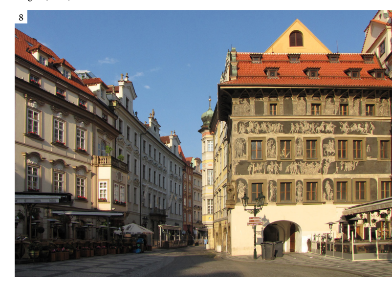
Figure 8. Old Town Square, Prague (2012) Figure 9. Houses from the turn of the 20^{th} century at the Republic Square, Prague (2011)

The numbers do not reveal much on their own. It is far more important to compare the environment inside and