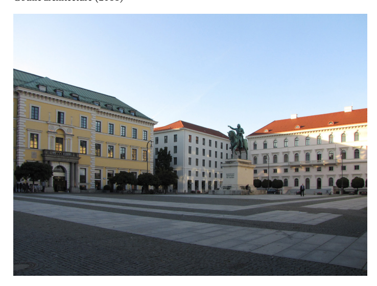
Figure 7. Wittelsbacher Platz, Munich, first half of the 19<sup>th</sup> century: While in the King's mind, Nuremberg represented German history, Munich was meant to become a showcase of the state's modernization. The classical architectural language was found to convey this better than Nuremberg's Gothic architecture (2011)

was a model example. The Bavarian King Ludwig I decided to save it from modernization, aiming not only to protect the architectural style (no buildings in the by then fashionable Neoclassical style were allowed among the Gothic landmarks) but also to preserve and fuel memories of the city's great cultural and political past, connected especially with Albrecht Dürer and his generation (Erichsen and Puschner 1986). This way, he created what theorists today call a "memory landscape" (Fig. 6-7). One of the first wilderness conservation areas was founded in 1839 by Count Georg Augustin de Longueval-Buquoy, the owner of the Nové Hrady manor, in South Bohemia, who decided to protect a remnant of the local primeval forest, creating what is now known as the Žofínský prales [Sophien-