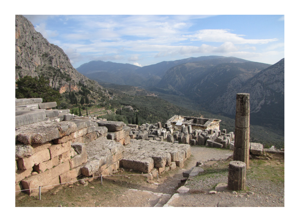
Figure 24. Delphi, Greece: A subjectively felt intensity of life in an environment is not dependent on the newness or youthfulness of individual elements — a solitary ruin may seem livelier than a new building filled with people (2009)

This paper was supported by the Ministry of Education, Youth and Sports of the Czech Republic through a grant received by the Palacký University in Olomouc (project IGA_FF_2020_025).