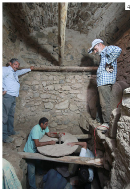
1: The main chamber after its excavation 2: The storage chamber after the roof construction 3: The main chamber after its excavation 4: The wheel reassembling at the main chamber 5: The wheel once it was reassembled (Sonia Beygi)