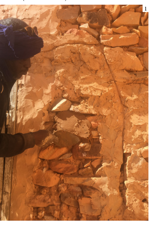
1: Local craftsman working on the finishing of an exterior wall 2: Tests of several mixtures for the finishings (Carmen Moreno)

Lack of maintenance is the main threat to heritage structures. In recent decades, social and economic changes have caused them to be abandoned and fall into disuse. One of the most alarming threats to Chinguettian heritage is xylophages, or termites, which climb up from the ground into floors and roofs and seriously damage their wooden structures. However, in recent times there has been a greater awareness of this heritage, of its fragility, and of the need to preserve it.