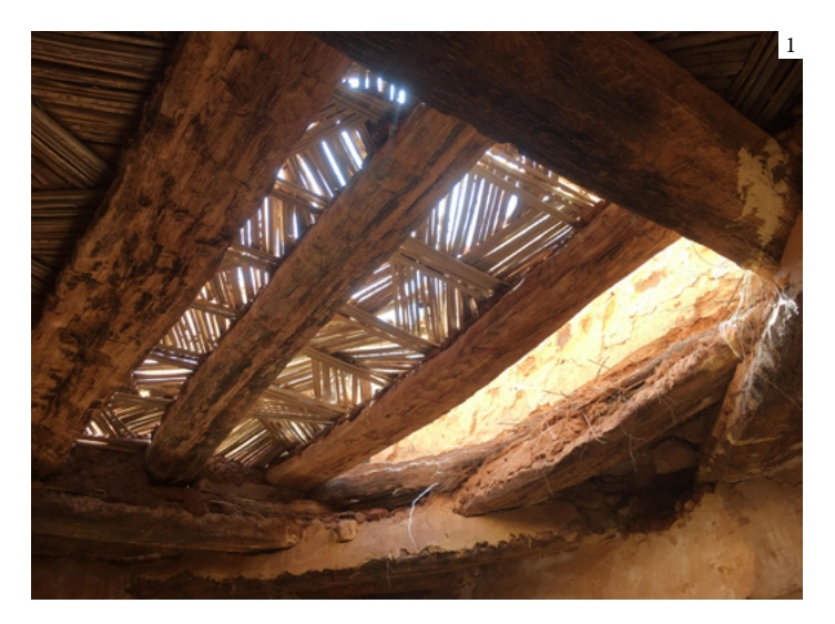
1: Collapsed roof 2: Roofing techniques during the restoration works

Roofing is made from palm wood beams (half or quarter trunks, depending on the required thickness) carpeted over with palm leaves. The maximum distance between walls is therefore 2.50 meters, which is the maximum height of a palm tree. Acacia wood has traditionally been used as well, and nowadays some bois rouge (African mahogany ) is imported from Senegal. Walls are topped with corbels, which are placed towards the inside of the building to better support the beams and reduce the distance between walls.