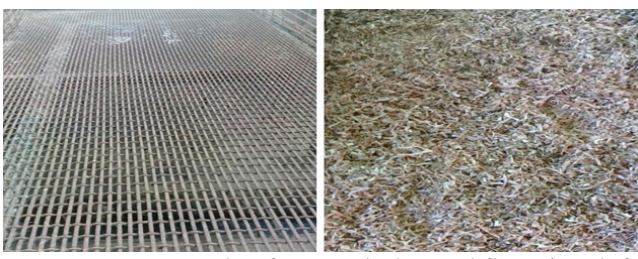
Figure 1. Pens made of expanded metal floor (RP, left side) and pens at ground level enriched with woodchip as bedding material (GL, right side) (Corral elevado con piso construido de metal expandido (RP, lado izquierdo) y corral a nivel del suelo enriquecido con viruta de madera como material de cama (GL, derecha).

The data were analyzed by the General Linear Model procedure of SAS version 8 (SAS, 1999). In order to determine the effects of housing systems (RP and GL) and sex (male and female) on DWG, DMI, FC, and