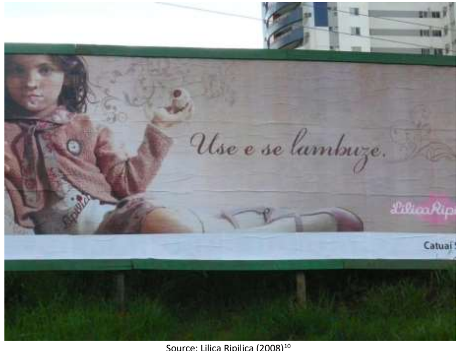
Figure 6 - Campaign Billboard "Use e se Lambuze", of the brand Lilica Ripilica (advertisement 6)