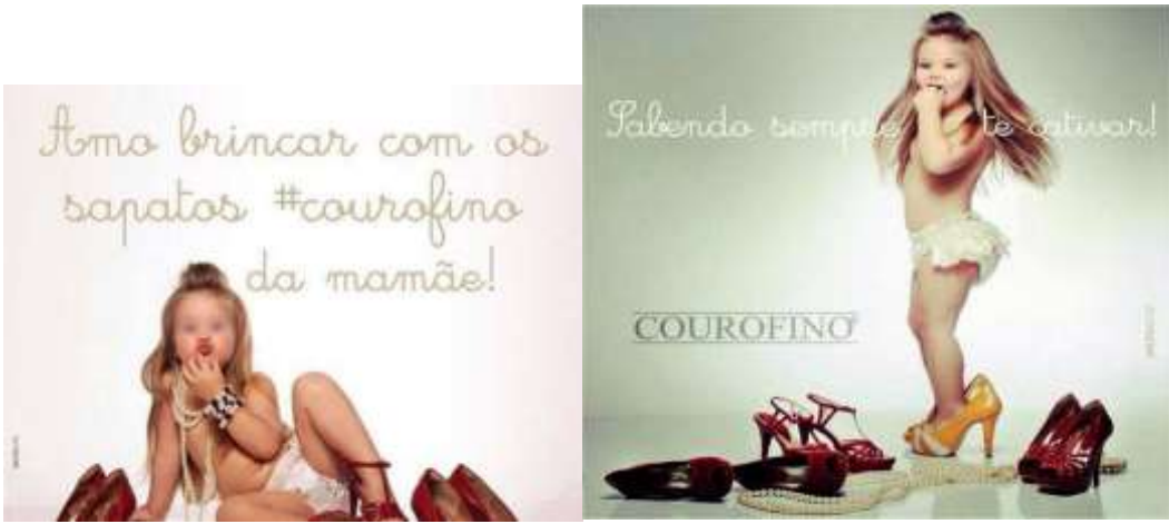
Figure 7 - Advertising pieces for the Couro Fino Children's Day Campaign (advertisement 7)

the Tea Time collection, which has a style inspired by the traditional English tea, remaining in circulation for a short period of time. Lilica Ripilica is a brand focused on class A, which has a strong purchasing power. Designed to promote its clothing collection, the "Use e se Lambuze" <sup>11</sup> campaign has generated controversy. According to a report published on the Instituto Alana website, the announcements were, by order of the Public Prosecution Service of Paraná, District of Londrina, withdrawn from circulation and in March 2009, during the adaptation period (TAC) between the State Public Prosecution Service of Santa Catarina and Marisol, it was decided that the company would no longer publish images of children as presented in the complaint presented, and would also pay a fine of R$20.000 to the State. On a billboard, the image of the child displayed shows a photo of a five-year-old girl sitting on a sofa, wearing the brand's clothes: skirt, blouse, vest and scarf, all in shades of pink and white, with high socks, white and a pink shoe. The child holds a candy in her hands, her face covered with sugar and cream, she looks at the camera with a half-smile on her lips. At the side, the words "Use e se Lambuze". The floral patterns adorn the background and the mark appears in the bottom right corner, closing the image. Although it is not clear the sexual link imagined, and there is no erotic appeal in the advertisement, there was a movement contrary to its exposure.