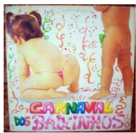
Figure 1 - Disc cover "Carnaval dos Baixinhos" (advertisement 1)

popularization of the Internet, more and more accessible over the years. The virtual reality with this becomes a place of virtual environment, in which the user can insert himself as if he were present. The technology presents itself with visual and sound effects, allowing total immersion in the virtual simulated environment. The user can interact or not with what he sees around him, depending on the possibilities of the system used.