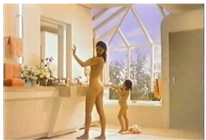
Figure 5 – Alfazema "Mother and Daughter" Campaign (advertisement 5)

This advertisement for the album "Me Faz um Carinho"<sup>8</sup>, by Gilberto Barros (1988), is described here to show how values and images from a period can be anachronistically questioned and criticized based on values in force at the time of criticism, and not when the advertisement was released. It was only in 2015 that the singer had to give explanations for what conservative sectors of society considered inadequate: the pose of the little boy with his hand inside his father's clothes associated with the album title – "Me Faz um Carinho". Although the explanation was simple and objective - the boy was only picking up bullets in his father's pocket to be quiet and be able to take the photo - the polemic was created around what was thought to be.