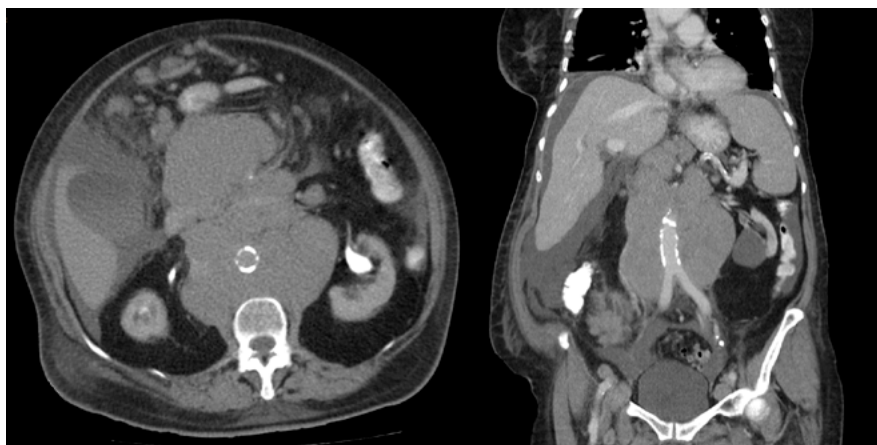
Figure 2. CT-scan of adenopathic inter-aortic-cava conglomerate in transversal plane (left) and coronal plane (right)