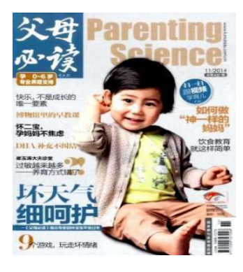
Figure 10. Parenting Science cover.

Regarding responsibility for childcare, official messages remain unclear or contradictory. On one hand, the ACWF explicitly encourages fathers' positive engagement, confirmed by an article titled 'father needs to hold up half of the sky in the family education' (Wang, 2017). On the other hand, the ACWF also insists on women taking more responsibility. For instance, the campaign of 'five good civilized families' was changed to ' zui mei jia ting ' (the most beautiful families) and its standards were revised. Most of the award winners of 'the most beautiful families' were mothers who not only do well in their career but also devote themselves to household duties.