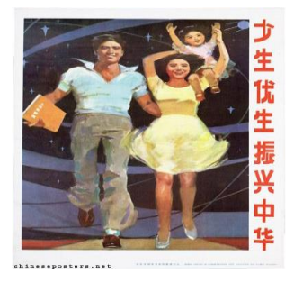
Figure 8. Girl with her parents.

than boys were always shown in the posters of implementing the one-child policy (see Figure 8).