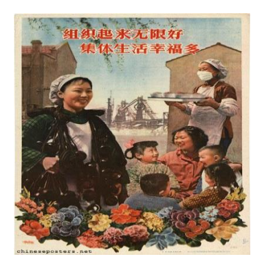
Figure 7. Communist happiness.

However, the collectivist supports did not function as well as expected and the people's sacrifices of 'de-familialisation' failed to accomplish the national targets of industrial development. Regarding parents' roles, educating children in class education became parents' revolutionary responsibility: