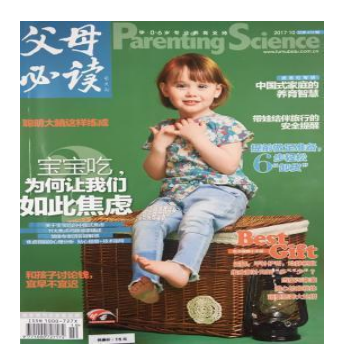
Figure 2. Parenting Science (PS, Fumu Bidu).

2) Parenting Science (PS, Fumu Bidu) is the first authoritative parenting magazine, launched in April 1980. It is a family education guide for parents of children aged 0-6. Since October 2008, its full electronic version has been freely accessible online, making it popular among younger computer literate pareuants. It is published nationwide with an annual circulation of 960,000 (see Figure 2).