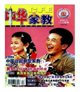
Figure 4. The Family Education of China (FEoC, Zhonghua Jiajiao).

4) The Family Education of China (FEoC, Zhonghua Jiajiao ) is the first official family education magazine, launched by ACWF and Chinese Family Education Association in 1993. It is a practical family education guidebook for parents of children aged 6-14 (see Figure 4).