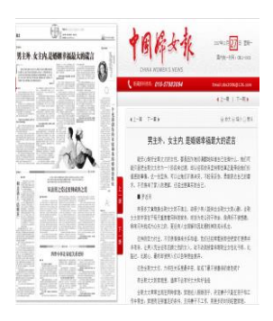
Figure 3. Women of China News (WoCN, Zhongguo Funu Bao).

4) The Family Education of China (FEoC, Zhonghua Jiajiao ) is the first official family education magazine, launched by ACWF and Chinese Family Education Association in 1993. It is a practical family education guidebook for parents of children aged 6-14 (see Figure 4).