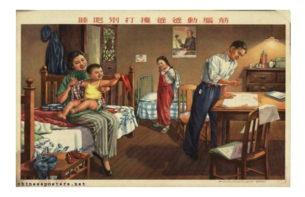
Figure 6. Mother putting her children to sleep while their father works.

Motivated by the goal of ' chao ying gan mei ' (surpassing Great Britain and catching up with the United States) and the national strategic goals of four modernizations (i.e., industrial, agricultural, national defence and science and technological modernization), China entered the Great Leap Forward (1958-1962). A series of collectivist social reforms broke up the original family structures, pulled individuals out of their families and embedded them in ' dan wei ' (urban units) or rural people's communes. These highlighted communist attempts at ' qu jia ting hua ' (de-familialization). The Party-State drew a picture of communist happiness (see Figure 7), shaping the collective psyche and providing collectivist supports including childcare.