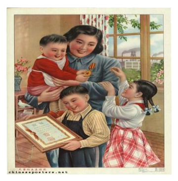
Figure 5. Mother with her children.

the labour force tended to be presented as support for mothers and put into full play by mothers, rather than as potential benefit to both parents, or fathers. Fathers were still portrayed with a focus on their work life and their main role as provider.