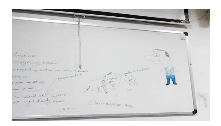
Figure 2. Students' discussion about students' voice & students-teacher relationship in class

The teacher's aim was to strike a balance between teaching language skills and critical literacy. So, he helped students take a critical stance towards the writing materials. The teacher also reminded students of their power to look at the writings through personal reflections and a critical lens. This kind of engagement was achieved by asking critical questions to promote students' critical consciousness. In this study, even though the teacher used those two textbooks as the mainstream of teaching, he tried to engage students in critical discussions by posing critical questions. Cervetti (2004, p. 6) also stresses that "the varied strategies that encourage students to take a critical stance toward text include textual analysis, dialogue, and questioning, or problem posing, which typically characterize critical practice". Figure 2 portrays one of those sessions when issues about suppression of students' voice, students-teacher relationship, and critical pedagogy were introduced (teacher's caricature is also on the board).