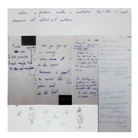
Figure 1. Sample of Students' notes on textbooks page margins

and persuasive was the next technique which students enthusiastically tried to learn and incorporate within their learning practices. "Becoming an individual", "Evaluating arguments", "Recognizing errors in thinking", and finally, "Applying your thinking skills" were the remaining chapters which guided students through a practical and step-by-step continuum to learn to think and further act as a critical thinker. Miri, David, and Uri (2007, p. 367) highlight that "the compelling empirical evidence shows that if one knowingly, persistently and purposely teaches for promoting higher order thinking among her/his students, there are good chances for success". In our class, students worked in groups to discuss what is taught in the class and further time is also provided for them in case they need to remain in the class. Students were seated in circle-like groups to work on each section of the chapters. At the end of each session, students wrapped up their understanding of each section based on their notes in the page margins and further elaborations were also provided for the students if they confronted vagueness in the text. Below is a sample of students' notes on page margins (Figure 1).