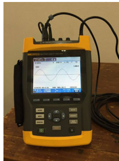
Figure 2: Specific cutting energy calculation.

To measure the voltage and current during wood mechanical processing, two test leads with a capacity of 600 V and 20 A were connected to the router. With the energy analyzer (Figure 2), the data of maximum, average and minimum active power (kW) required by the router were obtained over the cutting time (s). The equipment acquires the electrical variables uninterruptedly, generating power values every 0,5 s the minimum time required by the analyzer to adequately obtain the active power.