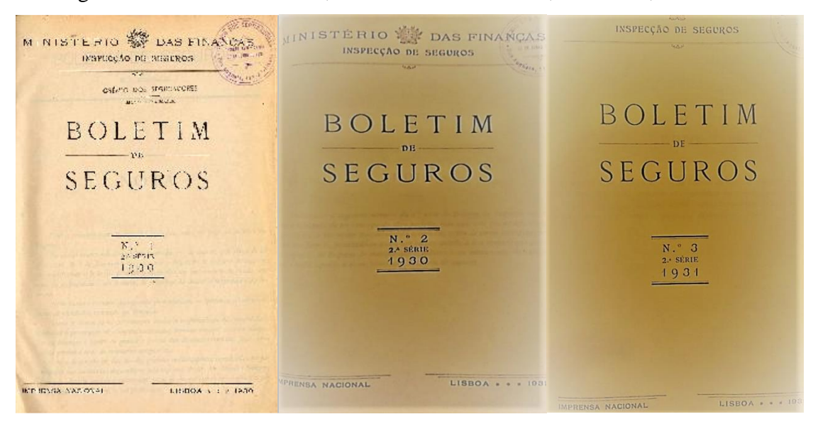
Figure 3 – Insurance Bulletin, No. 1 and 2 dated 1930, and No. 3, dated 1931

Thus, from 1930, the Insurance Bulletin – Figure 3 – started being published, in which the reports and accounts of insurance companies were included, assessing the comparability between the various insurance companies' accounts.