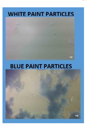
Figure 3. Paint particles at the microscope

To see the particles behavior or cohesion at a microscopic level the sample was submitted to a visual examination with a 400X magnification with a Hensoldt Wetzlar equipment in order to observe, obtaining Figure 3, as you can see, in the blue paint you can see the particles, in the white paint due to the color was not clear enough to be able to differentiate what was happening.