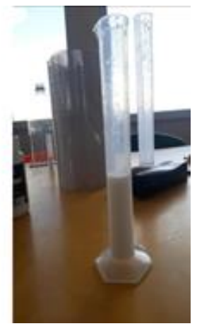
Figure 1. Amount of paint in the samples to perform the electrocoagulation test

A representative 200 ml sample was extracted from the paint water sample which was subjected to electrocoagulation for the analysis of pretreatment parameters, chemical oxygen demand (COD), dissolved oxygen (OD), turbidity, conductivity, pH and temperature.