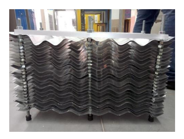
Figure 9. Laminar system for decantation and electrocoagulation of water-based paint removal equipment

Finally, Figure 9 shows the detail of the laminar system, where the contact area of the electrically inducing metal for medium solids is increased, while at the same time an accelerated decantation is induced by coalescence, taking advantage of the capacity of the solids to adhere to surfaces, in addition to the electrical current and the inclinations of the sheets that increase the efficiency of the equipment.