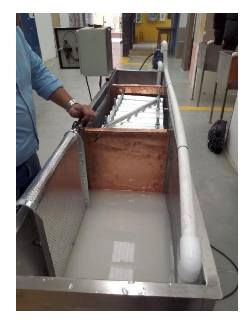
Figure 7. Roller washing water before treatment in the electrocoagulation equipment

The equipment built and installed can be seen in Figure 7, where the turbidity characteristics can be seen before the treatment of the washing water at the SENA Centre. Then in the Figure 8, a sample of water taken after the treatment can be seen, showing the degree of separation of paint and water after the electrocoagulation process.