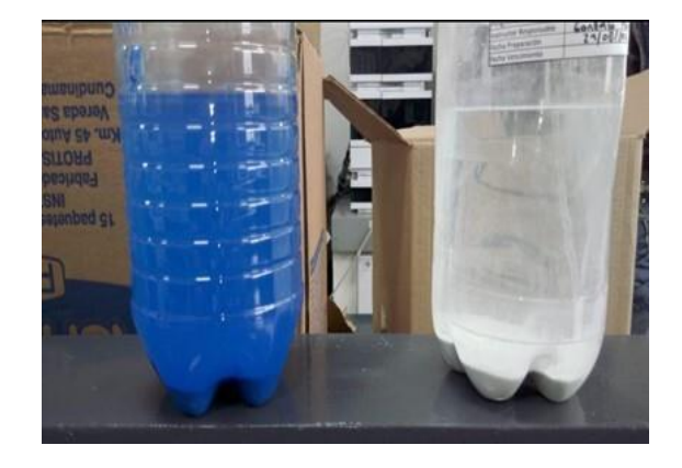
Figure 6. Samples after 1 hour of Electrocoagulation 5 days later

As the white and blue paints have different components, since they are of different brands, it can be seen how the separation was more efficient in the white paint sample.