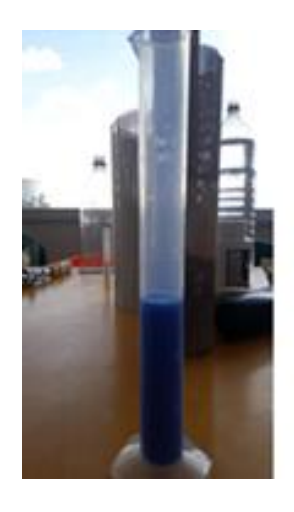
Figure 1 presents the preparation process of the solution of paint and water to be electrocoagulated. Liquid paint was measured in a quantity of 30 ml in order to prepare the final solution to be filled with water up to 2,000 ml.