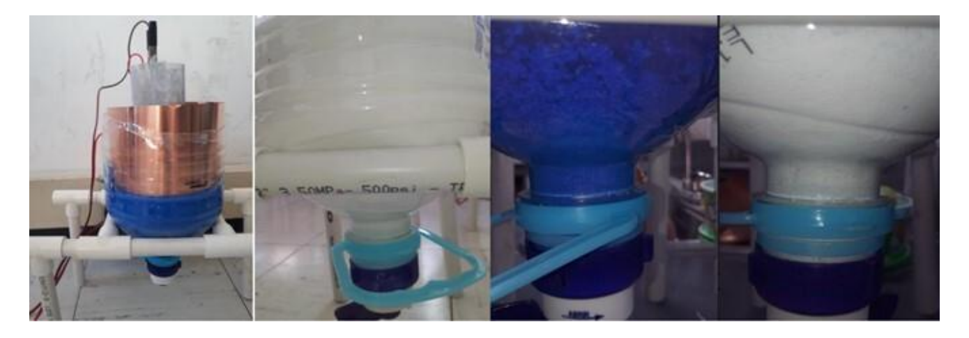
Figure 4. Left: two samples before treatment. Right: two samples after treatment

It is very important to highlight a result obtained after carrying out several tests with different samples to be treated, it is the capacity of destabilization of EC, in spite of the fact that it is disconnected from the current, as the sample is destabilized, the longer the rest time of the sample the more effective this separation is, this can be seen in the paint samples in Figures 5 and 6.