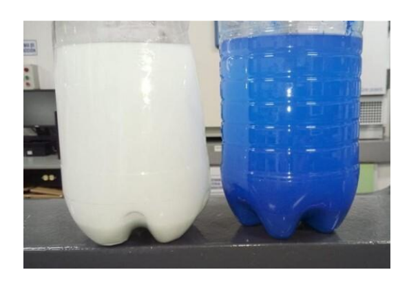
Figure 5. Samples after 1 hour of Electrocoagulation