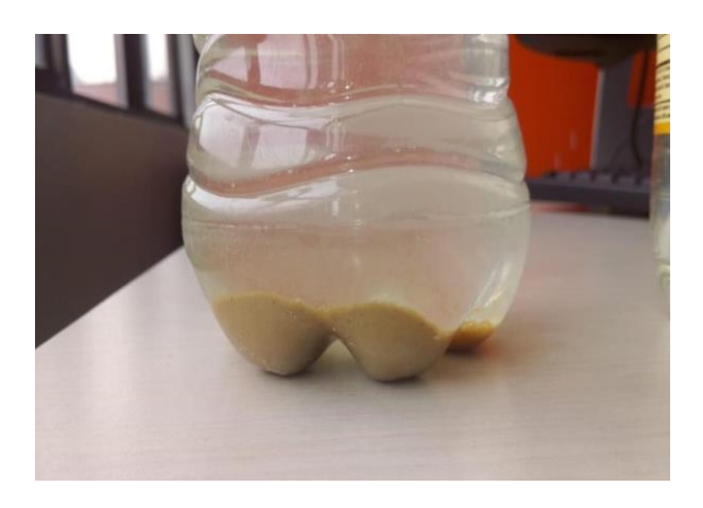
Figure 8. Roller washing water after one hour of treatment in the electrocoagulation equipment and one night of decantation

Finally, Figure 9 shows the detail of the laminar system, where the contact area of the electrically inducing metal for medium solids is increased, while at the same time an accelerated decantation is induced by coalescence, taking advantage of the capacity of the solids to adhere to surfaces, in addition to the electrical current and the inclinations of the sheets that increase the efficiency of the equipment.