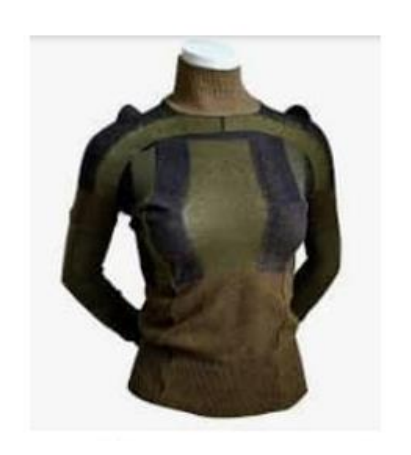
Figure 3: Deconstruction of the concept of fashion in time (2)