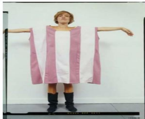
Spring summer 1990