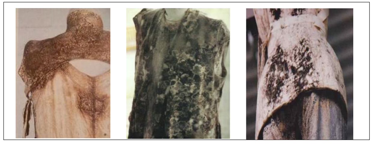
Figure 2: Deconstruction of the concept of fashion in time (1)

www.revistaorbis.org.ve / núm Especial Internacional (año 15) 103-117