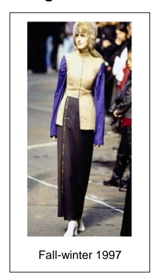
Figure 4: Some Margiela's secrets and clues