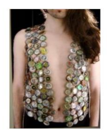
Spring summer 2001