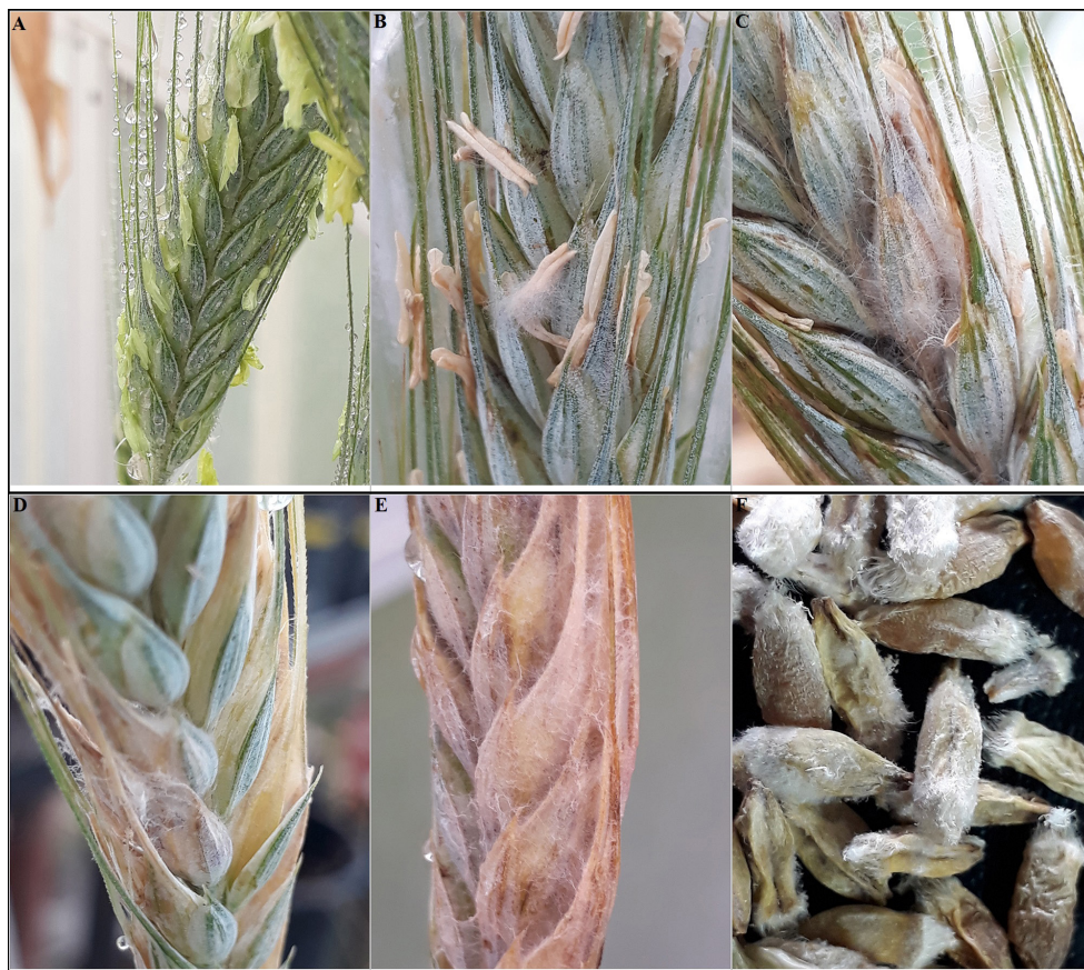
Figure 2. Fusarium head blight (FHB) progress in spikes inoculated with F. graminearum s.s. isolates collected on triticale. (A) Inoculation of the spike at anthesis. Disease progress at: 2 dpi (B), 7 dpi (C), 14 dpi (D), and 21 dpi (E). (F) grains at physiological maturity.

Based on morphological characteristics, the isolates obtained from triticale were identified as F. graminearum (Schw.). The presence of sporodochia formed by macroconidia with 5-6 septa with a width average value of 4.5\text{-}5\ \mu\text{m} and a length average value of 50\text{-}60\ \mu\text{m} was visualized. Moreover, abundant chlamydospore presence were visualized, which are frequently found in the macroconidia, while microconidia were not found (Leslie & Summerell, 2006). The results of F. graminearum specific PCR amplified a fragment of 400-500 pb as expected according to Nicholson et al. (1998). To confirm molecularly our results, the final sequences of red and tri101 fragments of T1 and T2 isolates were compared by