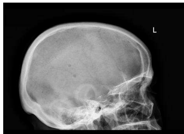
Figure 1. Lateral radiography of skull showing multiple lytic lesions.

During hospitalization the patient developed symptomatic bradycardia and a pacemaker was implanted. Due to intracardiac thrombus detection, hypocoagulation treatment was initiated.