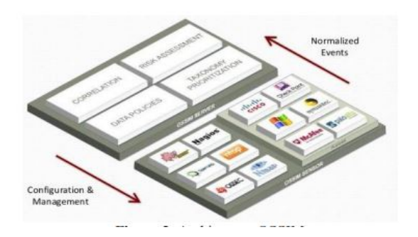
Figure 2. Architecture OSSIM.

OSSIM(Open Source Security Information Management) Open source distribution to build a security monitoring infrastructure that aims to provide a framework for centralizing, organizing and improving detection and visibility capabilities in monitoring security events within an institution (Figure 2). Advanced Network Threat Detector, developed using data shared by the Open Amenza Exchange (OTX) community, in addition to compliance with standards and basic reporting to support the information required by auditors and managers.