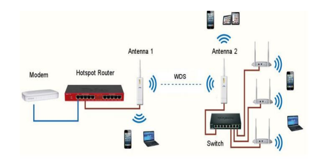
Figure 3. Hotspot router Mikrotik together with antennas connected WDS.

WLANs provide access to the network by means of a brocade signal through a radio frequency (RF) carrier. A station may