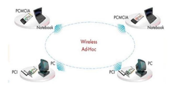
Figure 5. Illustration of a connection AD HOC.

An ad hoc mobile network is a network formed without any central administration or there is no central node but consists of mobile nodes that use a wireless interface to send packets of data where all computers are under equal conditions.