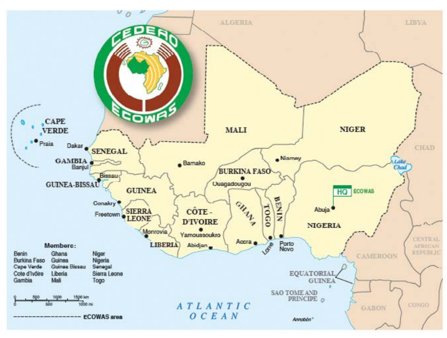
Figure 4. Map of State Members of the ECOWAS.

The archipelago strategic value should comply with political variabilities and economic dynamics. Further, it is also possible to realize that the whole discursive analysis around specific island characteristics of Cape Verde is a mere appropriation of history. Both geopolitical dynamics and historical conjunctures condition and activate "the valences that, in a particular time, make a particular place or space be more or less conducive to the coordination of boards and relational flows with other spaces" (Tavares, 2016, p. 13). The author presents a more detailed and in-depth analysis, considering that the archipelago currently has "a great strategic value to the transnational criminal networks, which have proliferated with regard