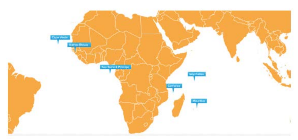
Figure 2. Geographic Location of African sids.

In the last decade, the United Nations Office on Drugs and Crime (UNODC) official data indicates that large amounts of cocaine are stored in West African countries. Its origin is mainly South America and is carried to Western Africa by sea. Three main routes are used, namely, the Northern route, from the Caribbean via the Azores to Portugal and Spain; the South America Central route via Cape Verde or Madeira and the Canary Islands to Europe; and more recently, the South America African route to West Africa and, then, to Spain and Portugal (UNODC, 2018a; 2018b) (Figure 3).