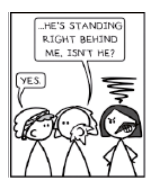
Figure 3. In Act 2, Scene 3 (part 1) Malvolio enters the carousing scene.

She immediately launches into the carousing scene and ends with the appearance of Malvolio, whose physical portrayal in the panel – fuming and frowning with his hands on his hips and bared teeth – are suggestive of his bossy, officious nature (see fig. 3).