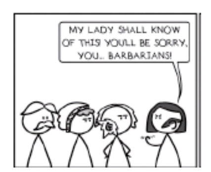
Figure 4. In Act 2, Scene 3 (part 2) Gosling's drawing echoes the original text.

Condensation is an essential part of the transposition from play to comic, and as Perret notes, "in most comics pictures of actions speak louder than words" (2004: 75). Although this requires "comic-savvy readers" to "[unpack] the meaning and