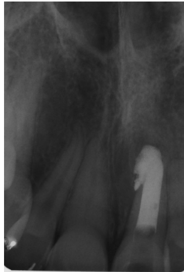
(B) Final radiography