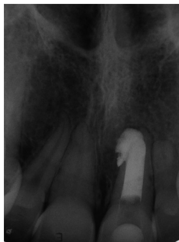
(E) 11 years follow-up