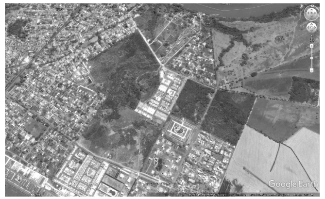
Figure 4. Aerial photograph from July 23, 2015, at an elevation of 284 m, approximately.