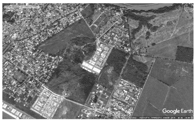
Figure 3. Aerial photograph from February 14, 2012, at an elevation of 284 m, approximately.