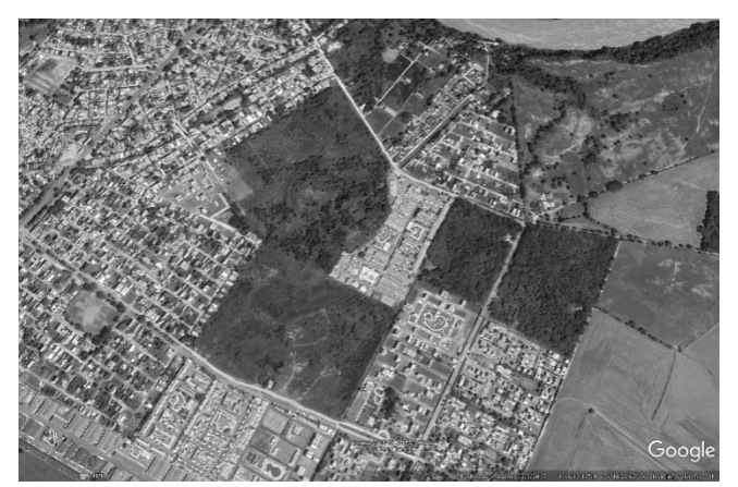
Figure 5. Aerial photograph from May 2, 2017, at an elevation of 284 m, approximately.

The range of Espinal (Qae), originated with the contribution of the Cerro Machín volcano, with a high volcanic content and finer material from the Quaternary Age. This fan, in the